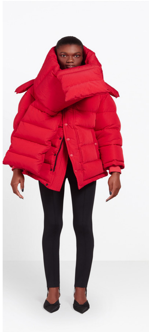
BALENCIAGA FALL/ WINTER 2017