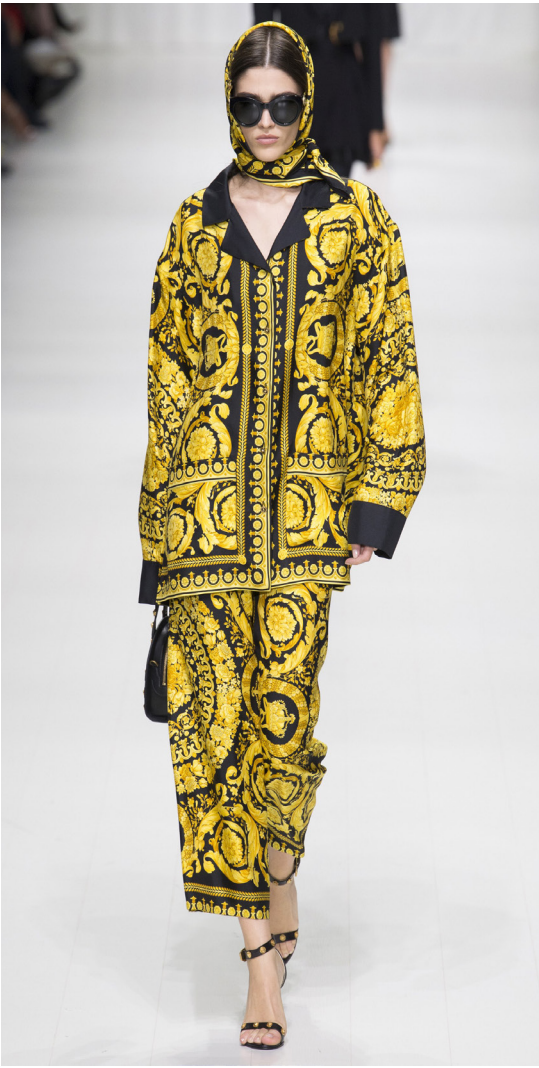
VERSACE SPRING 2018