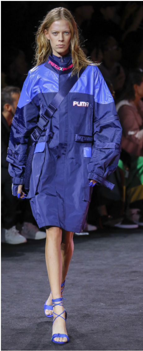
FENTY X PUMA SRPING 2018