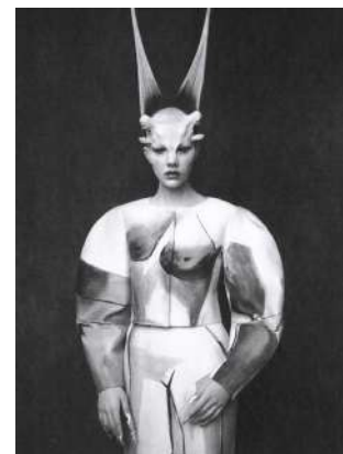
FECAL MATTER DIGITAL FASHION INFLUENCER