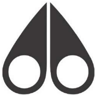
MOOSE KNUCKLES OUTERWEAR BRAND

SINCE 1921, MOOSE KNUCKLES' FAMILY HAS BEEN PROTECTING CANADIANS FROM THE COLD. THE BRAND WAS BUILT ON THE BELIEF THAT WE COULD MAKE THE LEANEST, TOUGHEST AND MOST LUXURIOUS SPORTSWEAR IN THE WORLD. MOOSE KNUCKLES IS AN EXCEPTIONAL OUTERWEAR BRAND AVAILABLE ACROSS THE GLOBE.