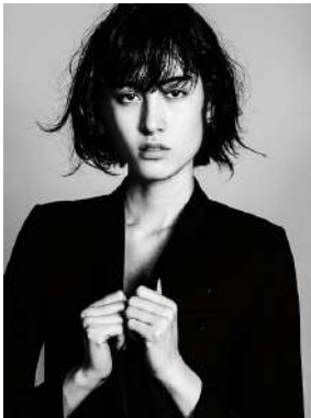
CAMI YOU TEN MODEL

MODELING AGENCIES: NEW YORK -FUSION MODELS PARIS -PREMIUM MODELS MILAN -WHY NOT MODEL MANAGEMENT BARCELONA -UNO MODELS HAMBURG -M4 MODELS