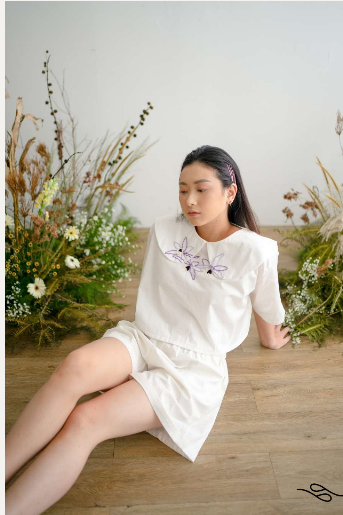
White Purple Orchid Top