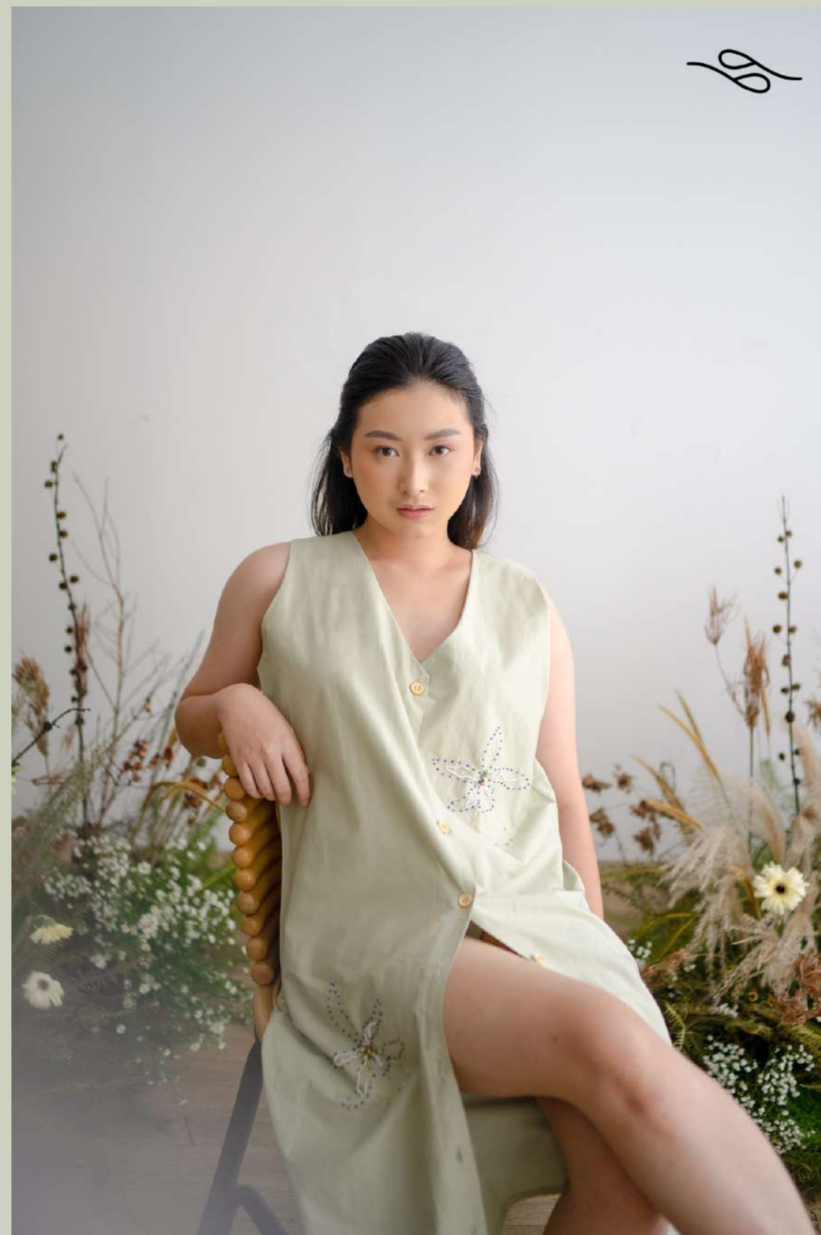
Green Sage Midi V Neck Dress