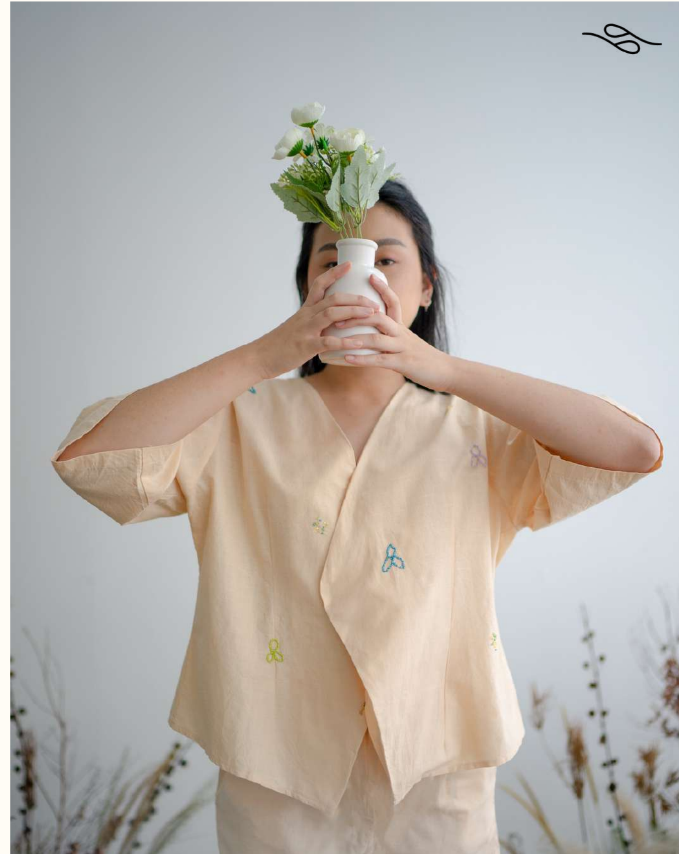
Cream Kimono Set