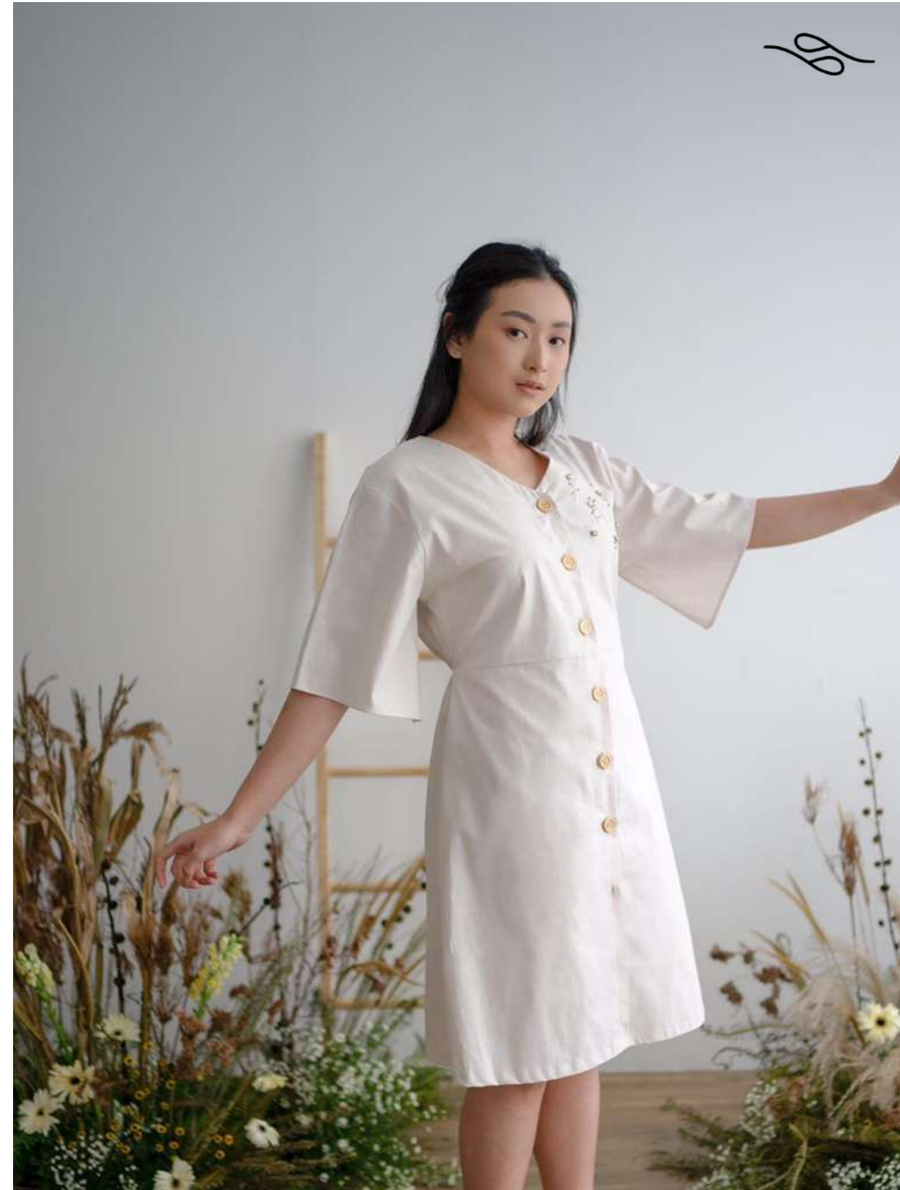
Pearl White V Neckline Dress