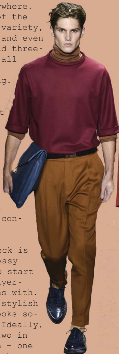
Paul Smith F/W 16

We've become accustomed to various layering techniques in both menswear and womenswear. It also was the