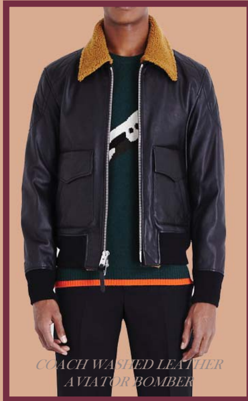
COACH WASHED LEATHER AVIATOR BOMBER