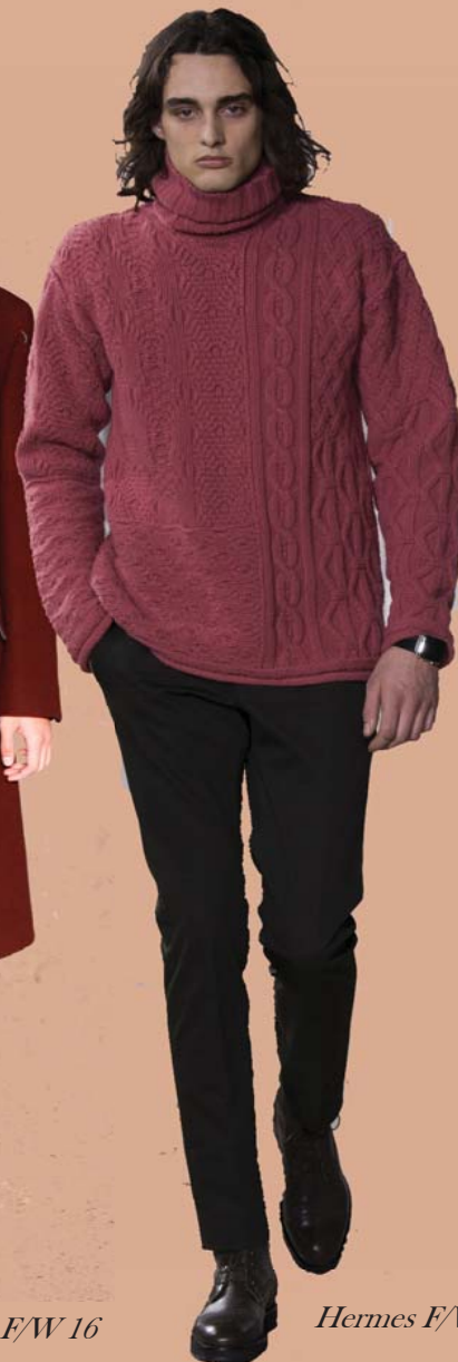
Hermes F/W 16

"TURTLENECKS ARE MAKING A SERIOUS PLAY TO JOIN THE RANKS OF THE CREW NECK, V-NECK AND CARDIGAN AS A STAPLE OF THE SWEATER WORLD."