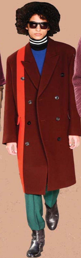
Berluti F/W 16