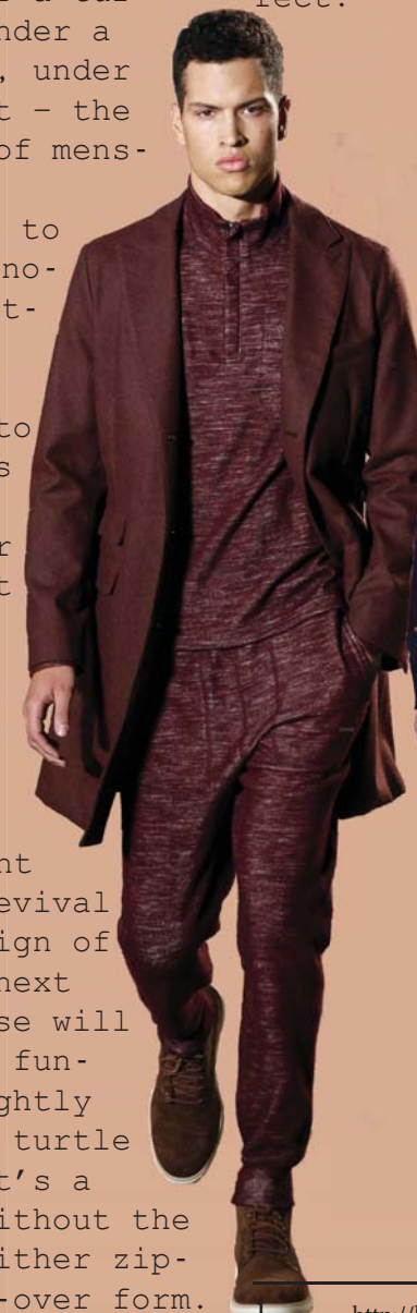
http://hespokestyle.com/mens-trends-new-york-fashion-week-2016/ Todd Snyder F/W 16

Slide one under your new slouchy coat with jeans for max effect.'