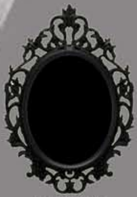
FOCOLTONE 412 0C