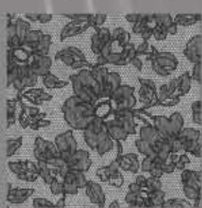
91% Nylon, 9% Spandex