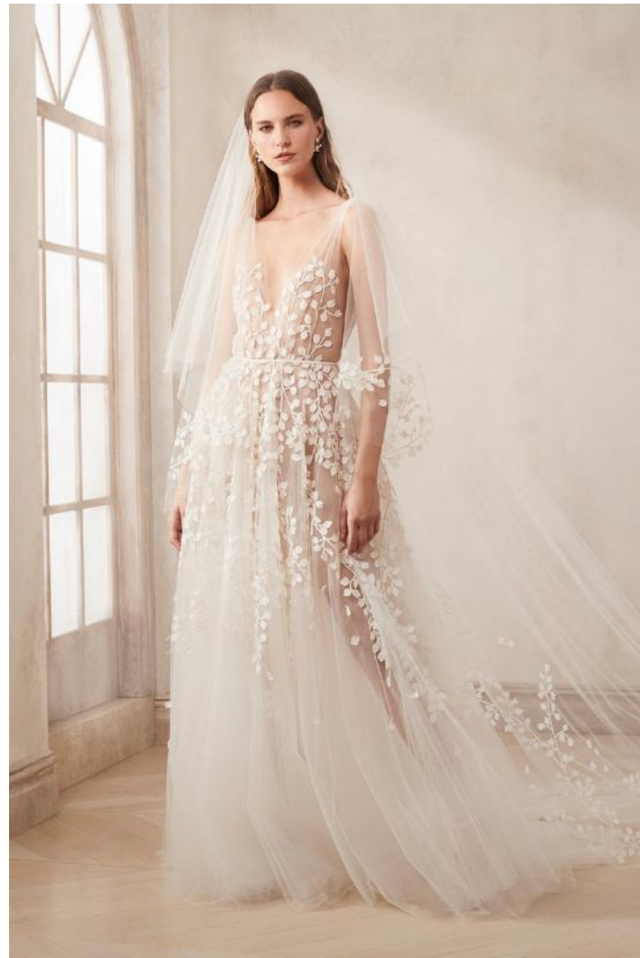
Oscar de la Renta