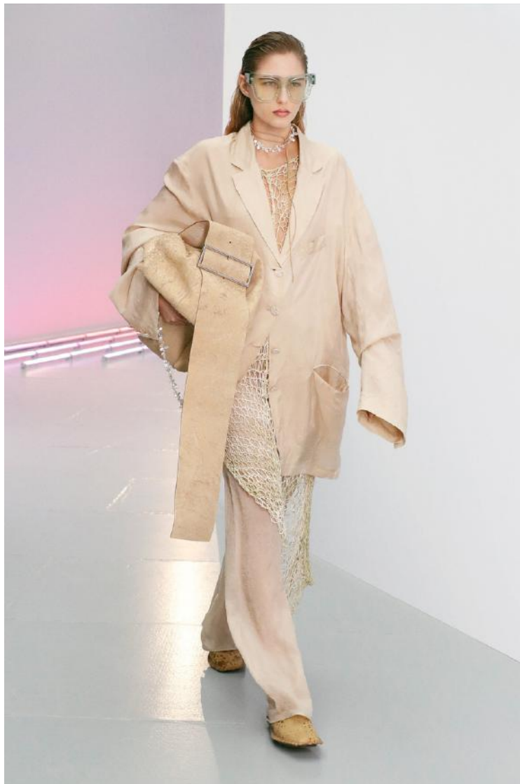
Acne Studio (Spring 2021 RTW)