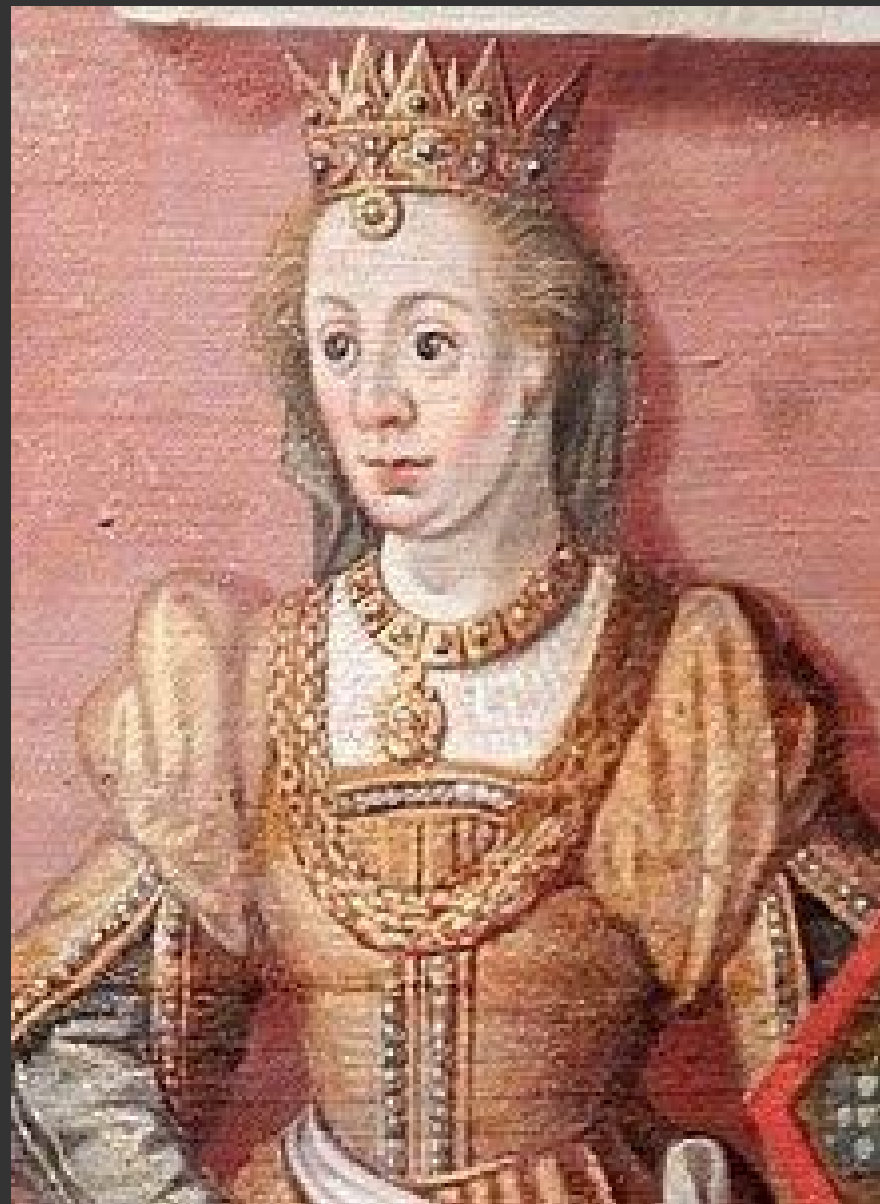
Philippa of England Queen of Denmark, Norway and Sweden