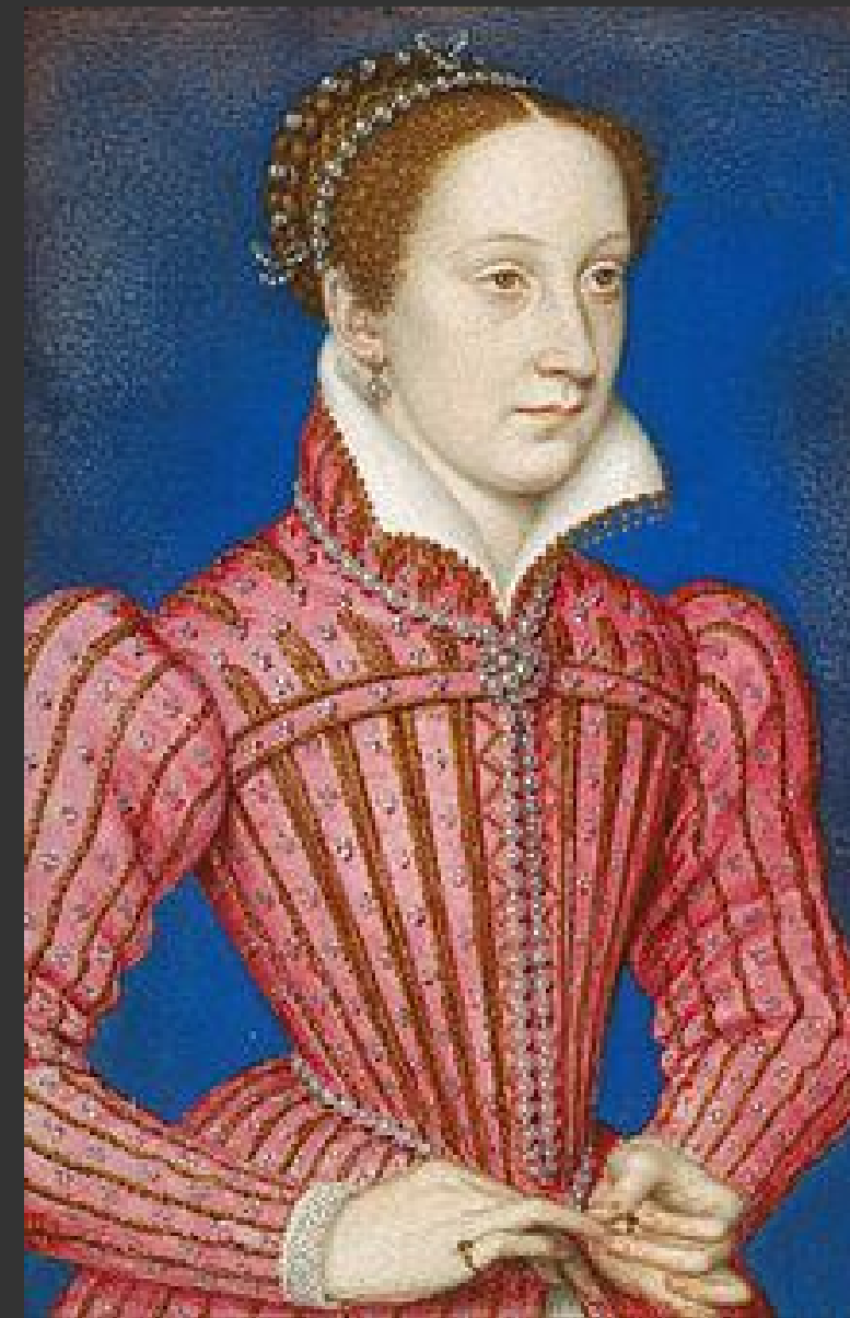
Mari Mary Stuart Queen of Scots