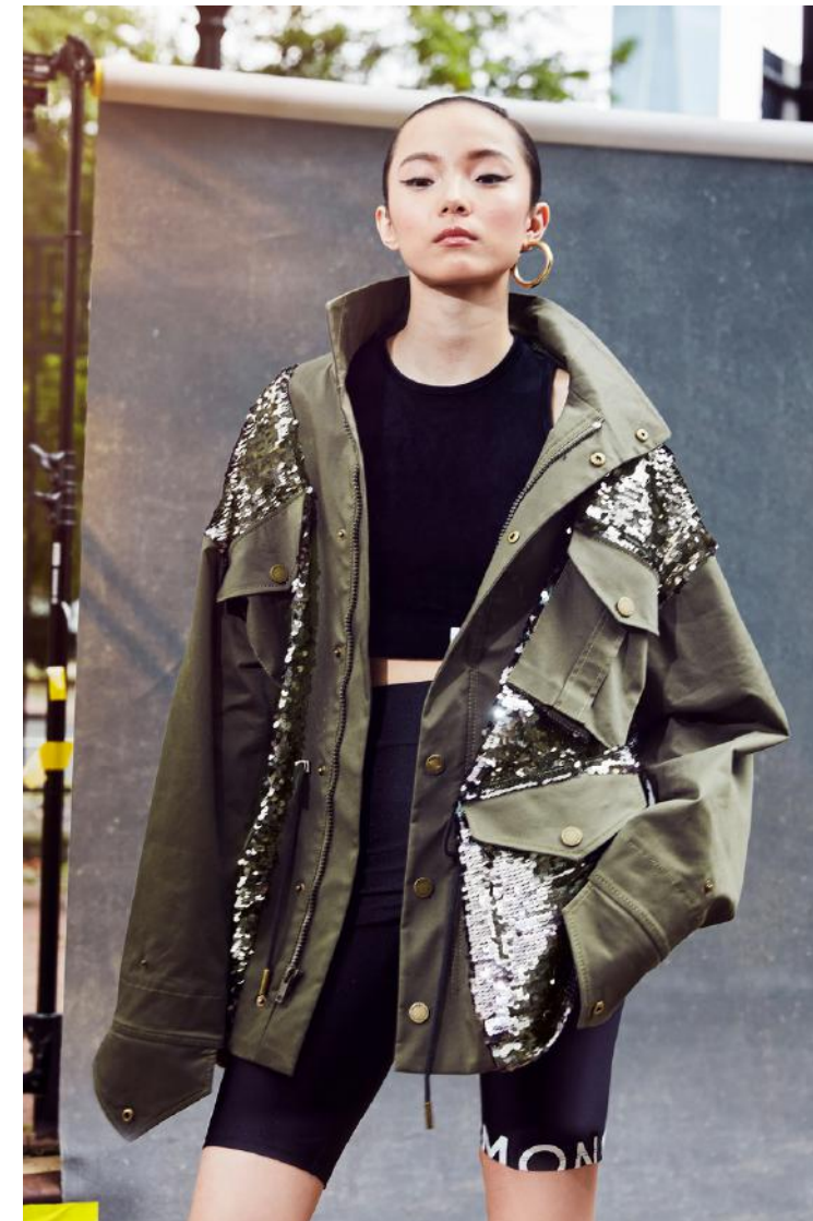
Monse (Resort 2021)