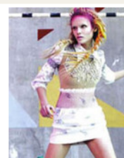
Women's Active Contemporary Lifestyle Color S/S 2019