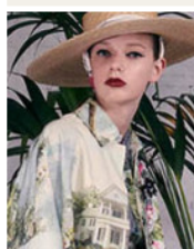
Womens Apparel and Accessories Color Trends S/S 2019