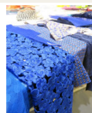
Interfilere Paris Spring Summer 2019 Overview