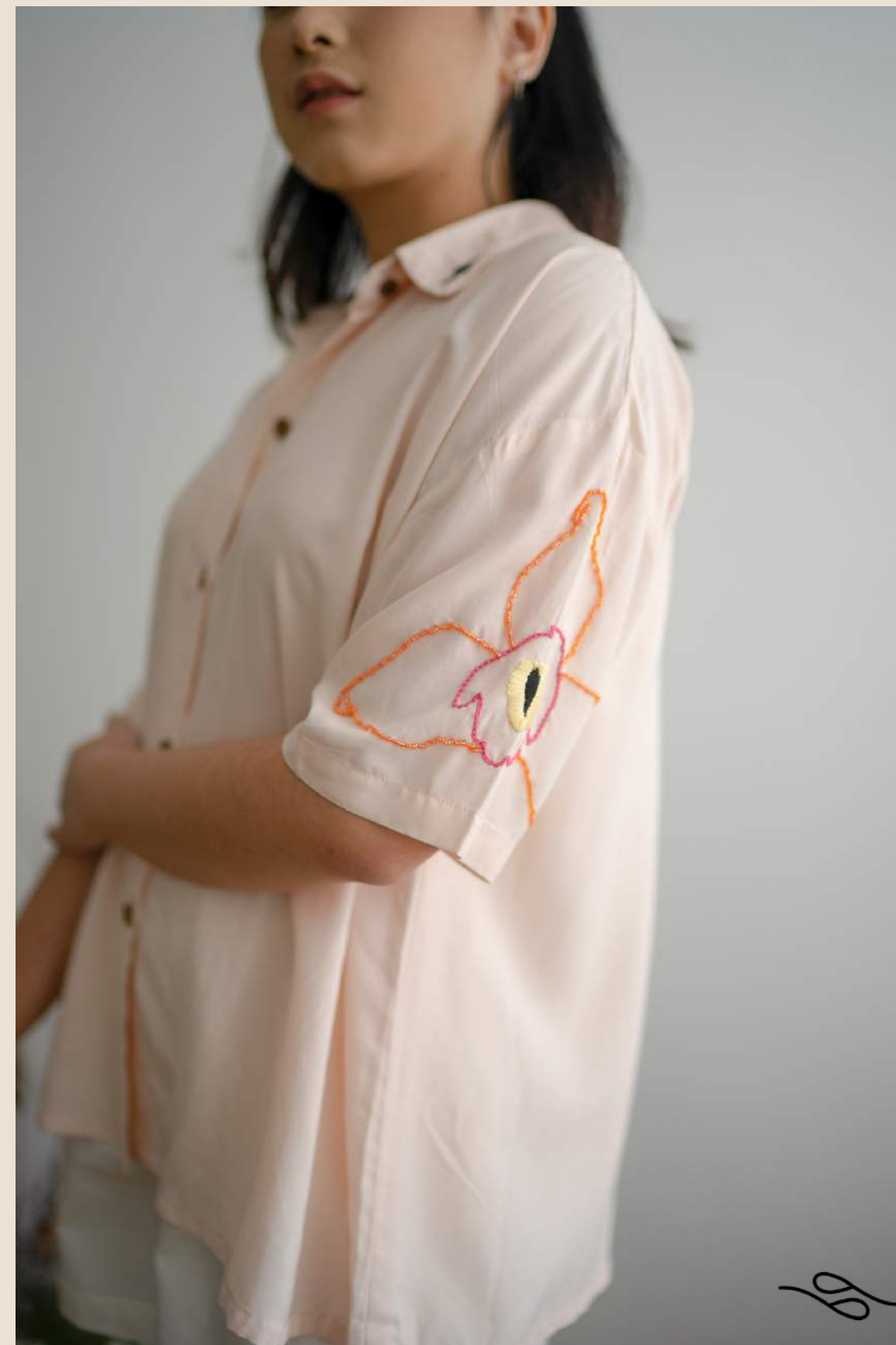
Peach Oversized Shirt