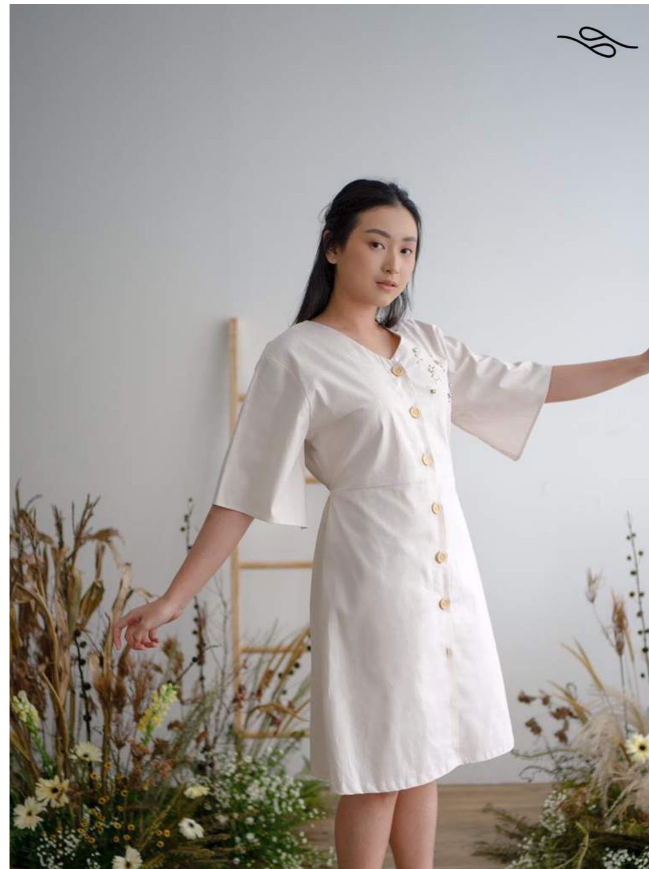
Pearl White V Neckline Dress