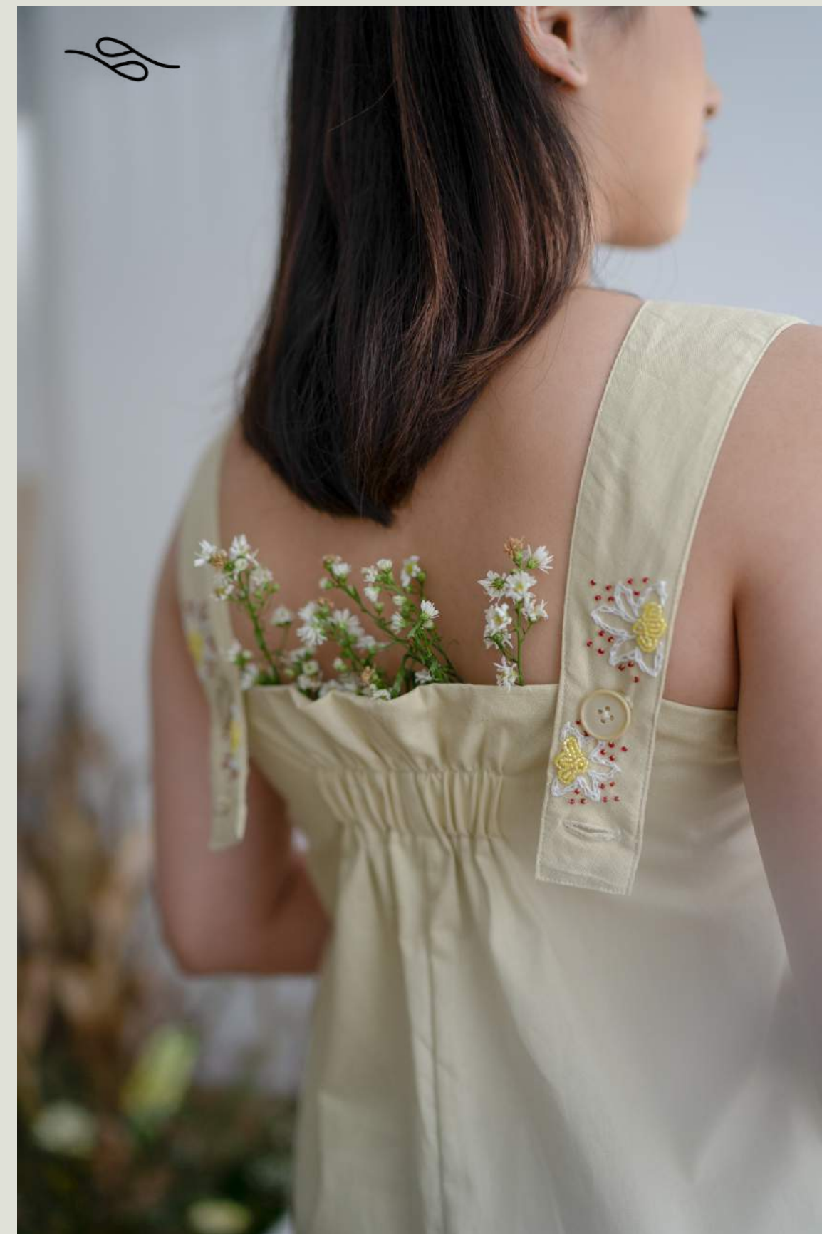
Pale Lime V Neck Playsuit