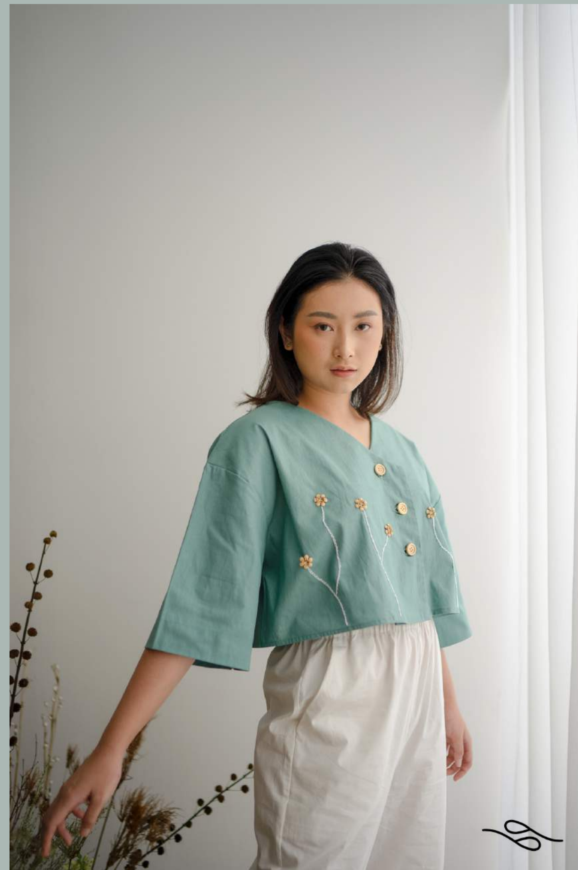
Night Green Kimono Crop Top