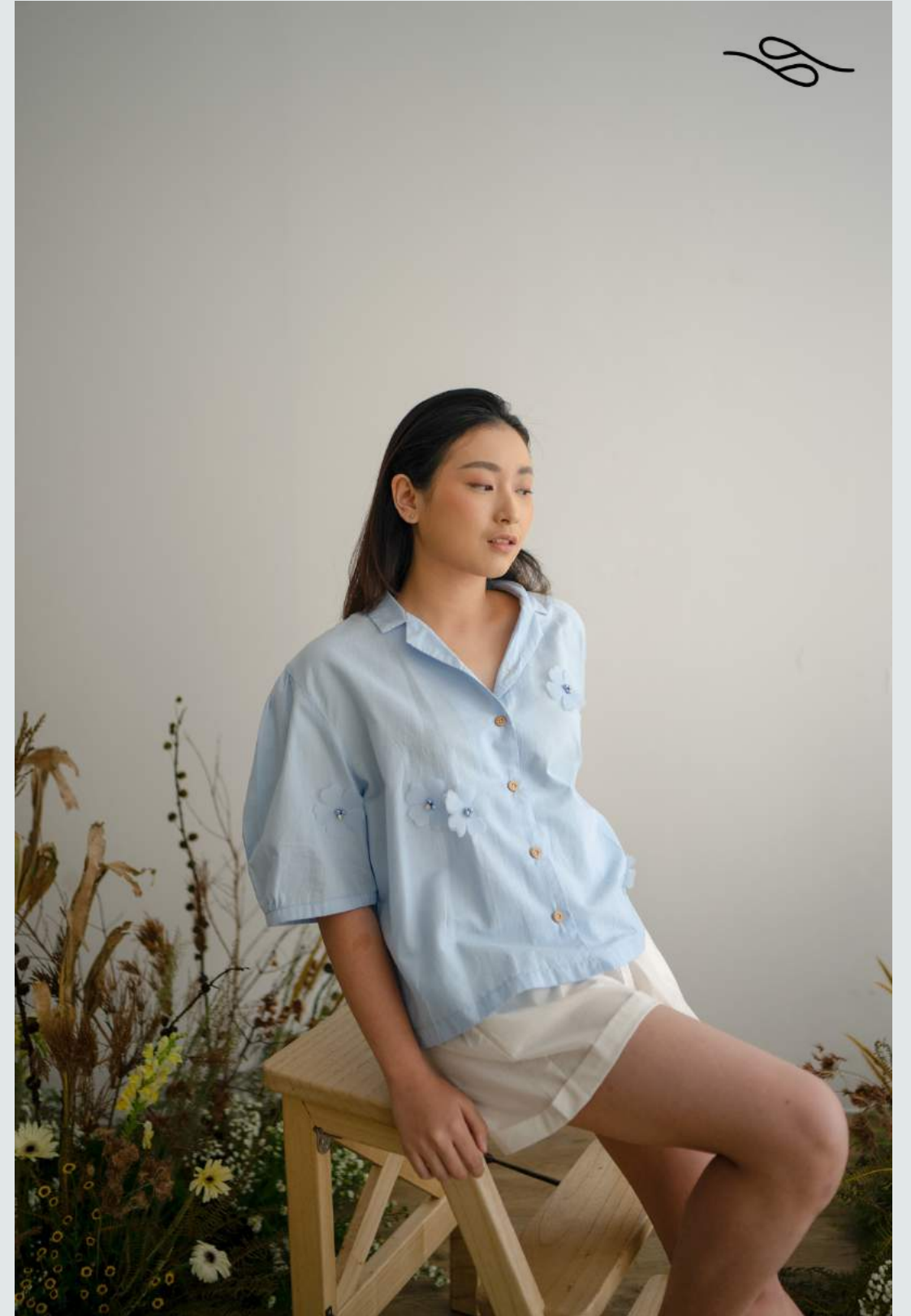
Light Sky Blue Flowery Top