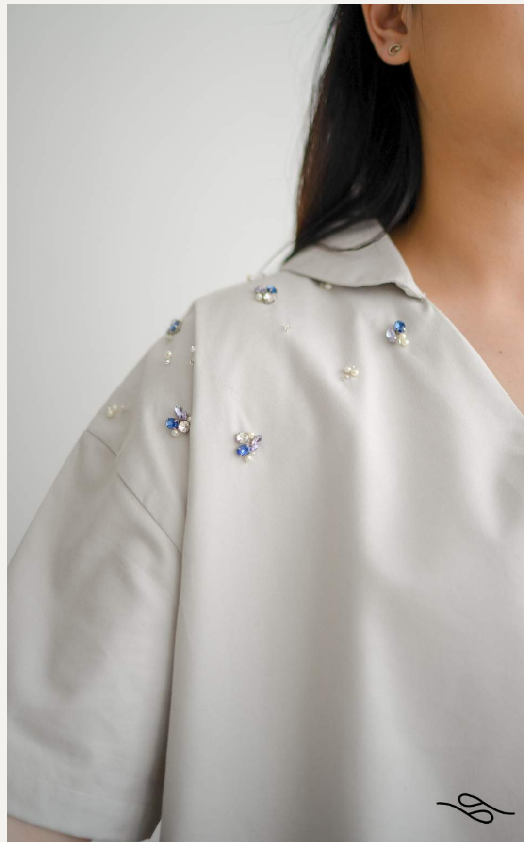
Assymetrical Gray Top