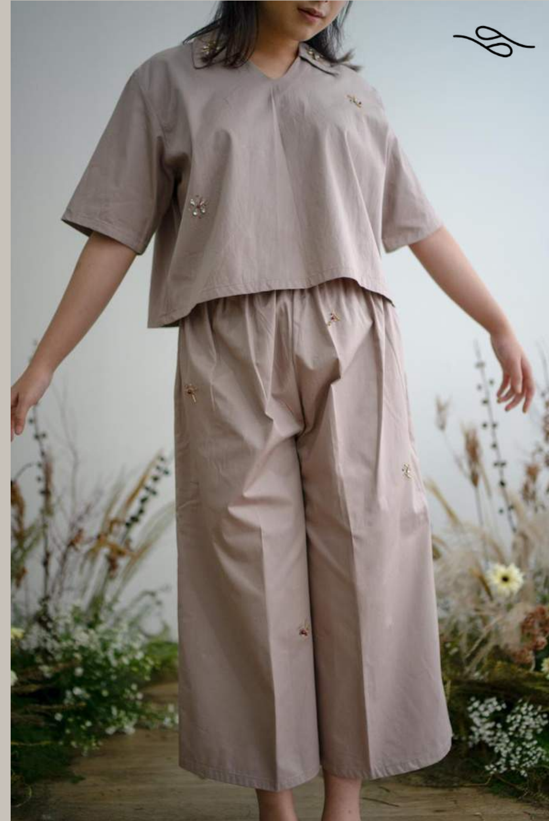
Fossil Long Pants Set