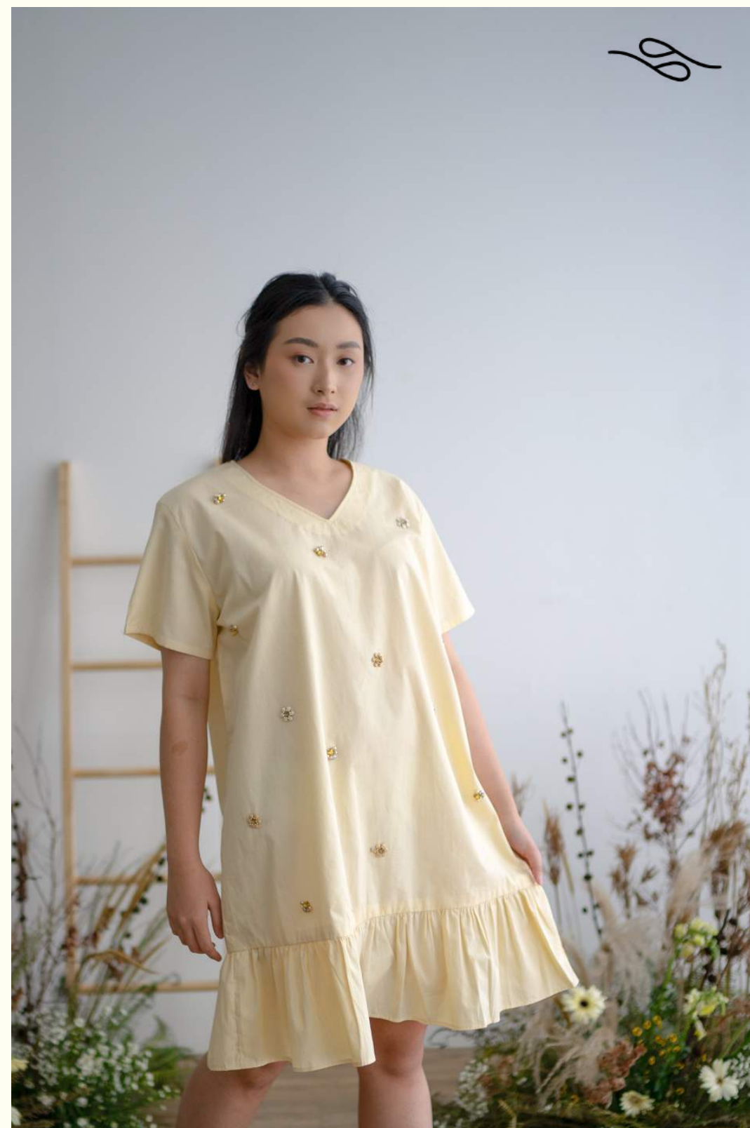
Butter Mini Dress