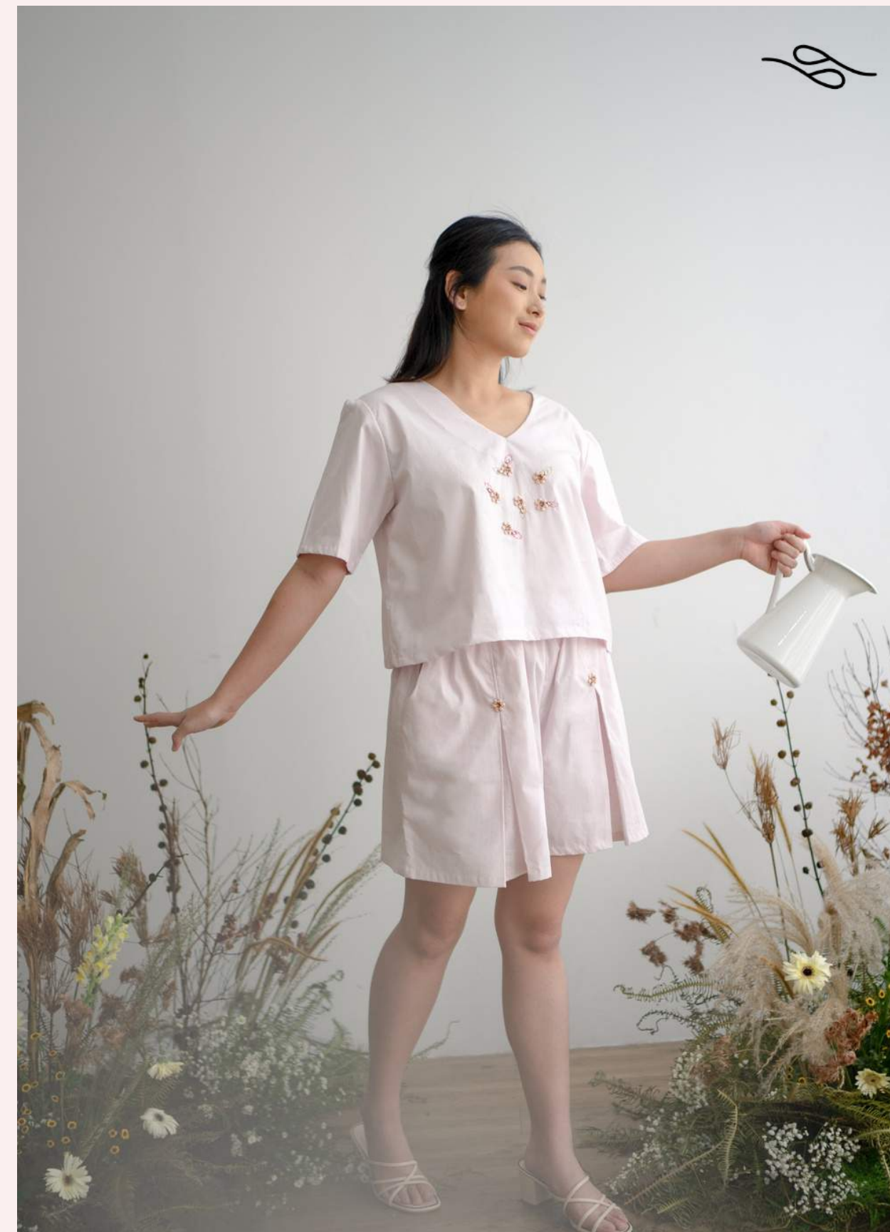
Soft Pink Slit Set