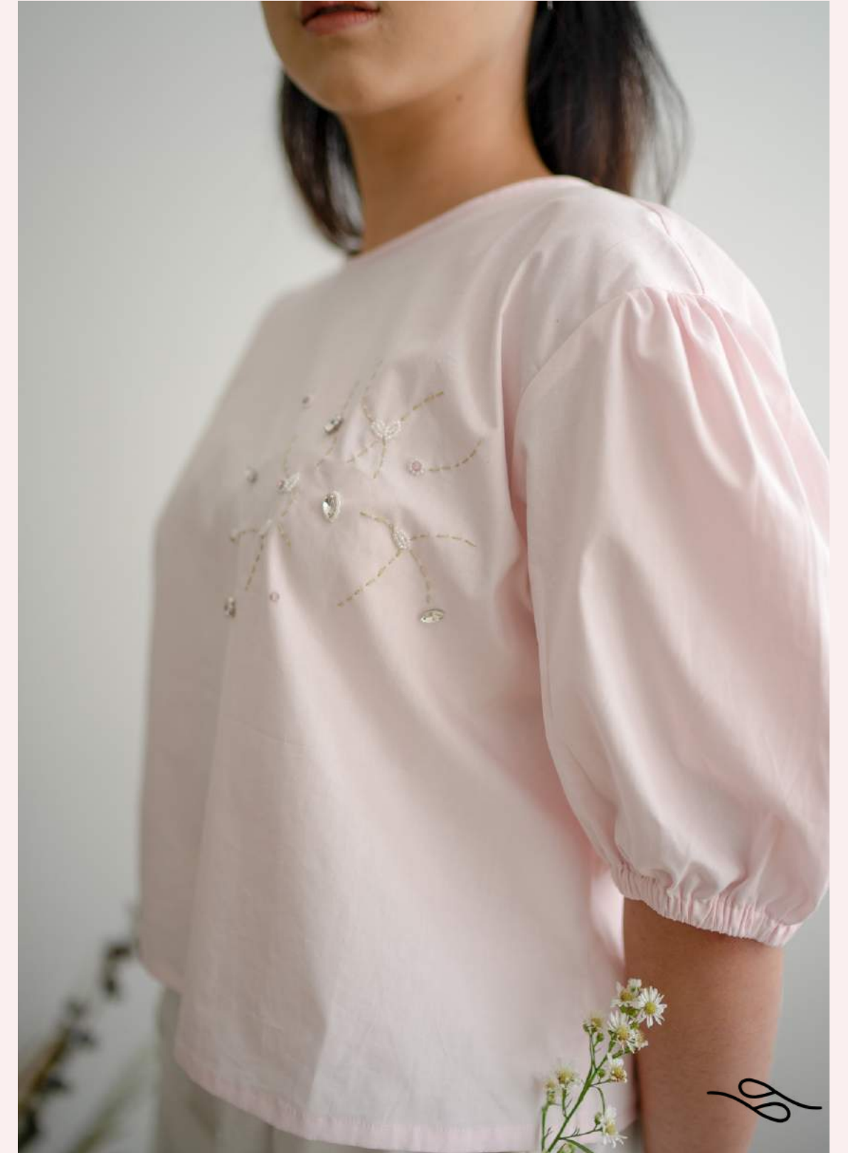
Soft Pink Backless Top