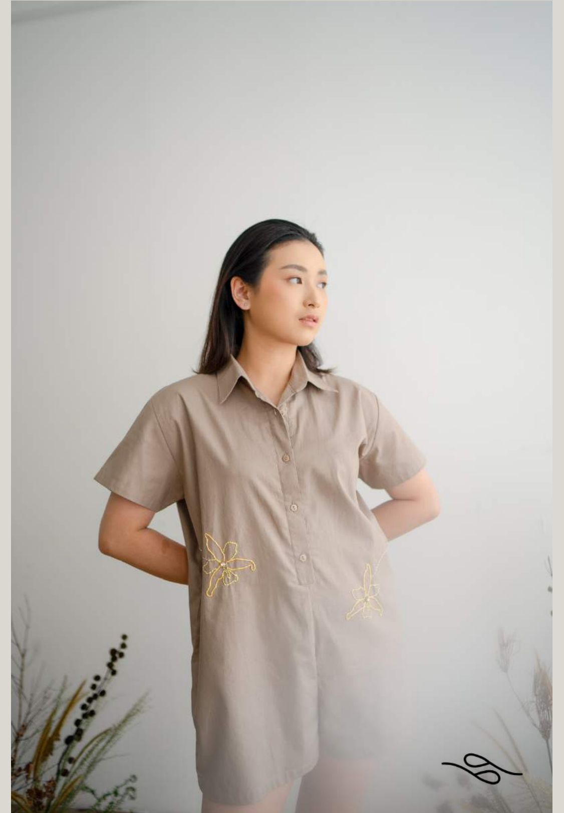
Ash Brown Playsuit