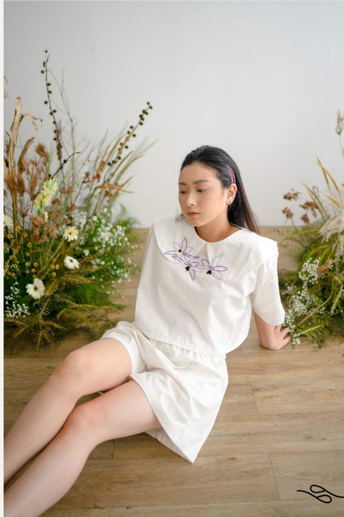
White Purple Orchid Top