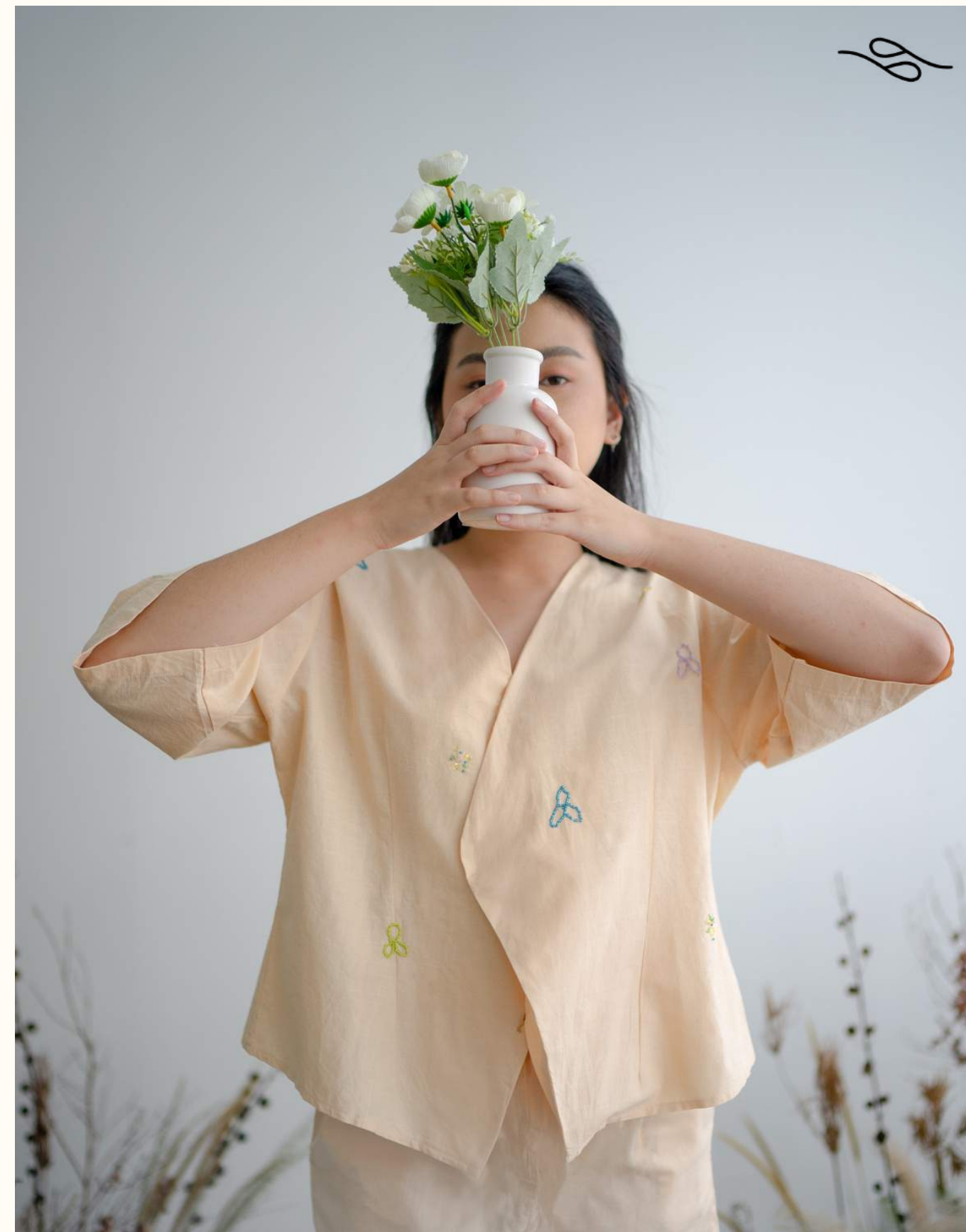
Cream Kimono Set