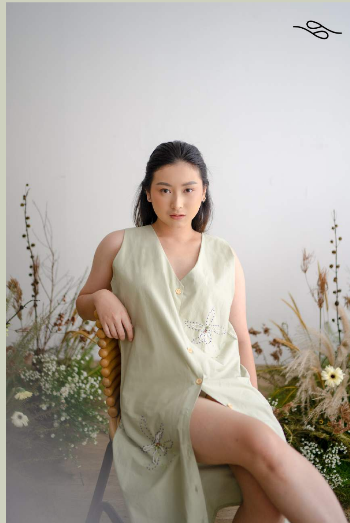
Green Sage Midi V Neck Dress