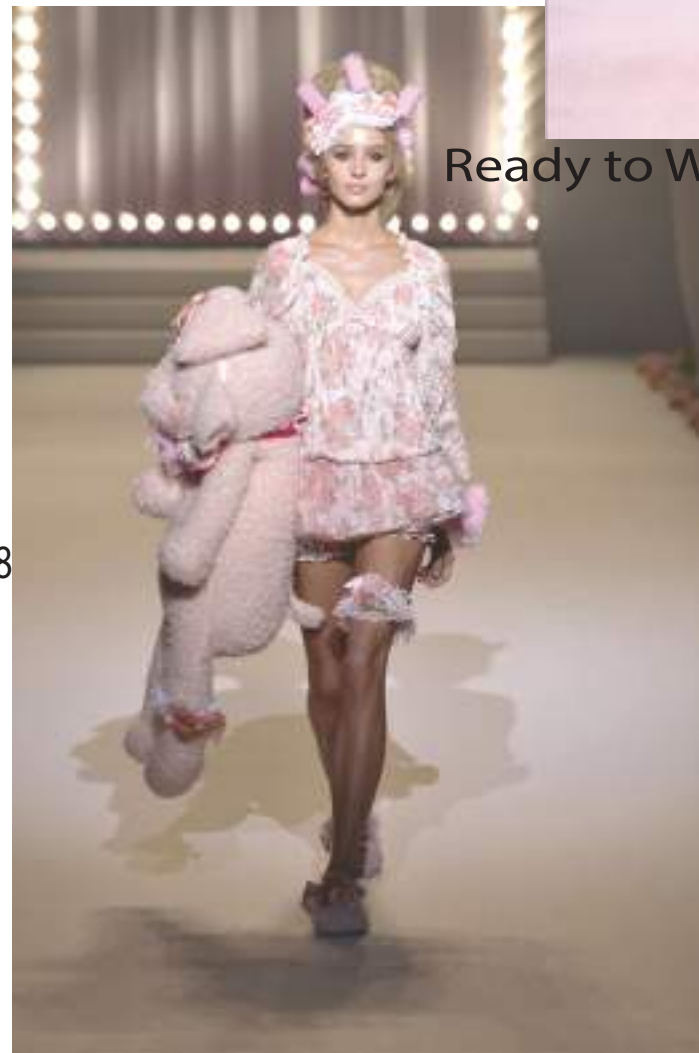
Ready to Wear by Liz Lisa Summer 2011