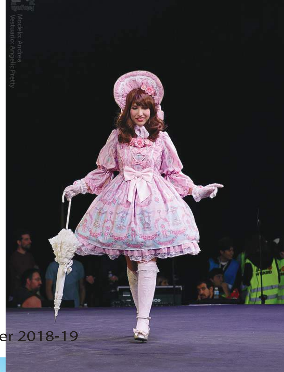
Ready to Wear by Angelic Pretty Spring 2018