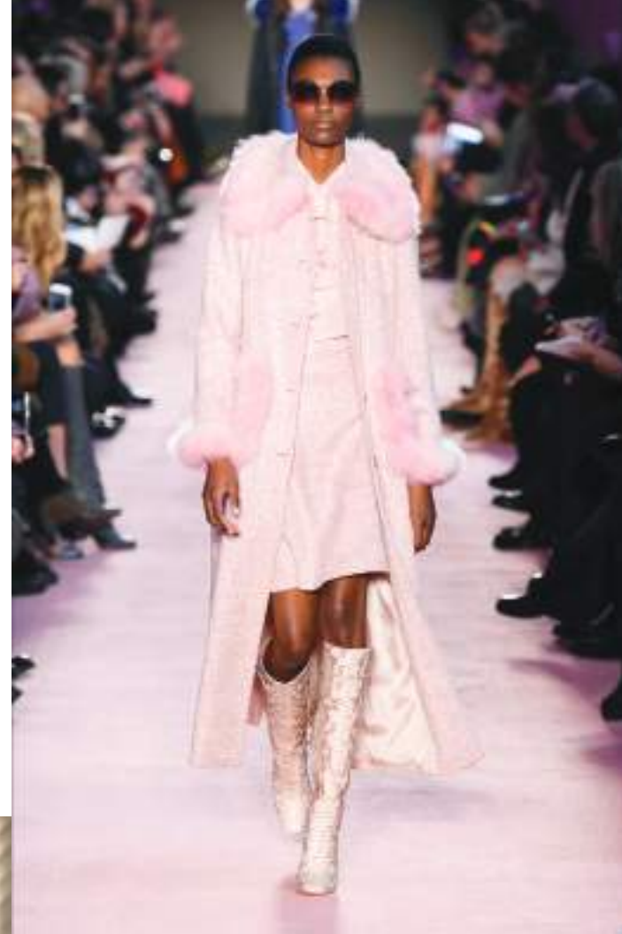
Ready to Wear by BluMarine Fall Winter 2018-19