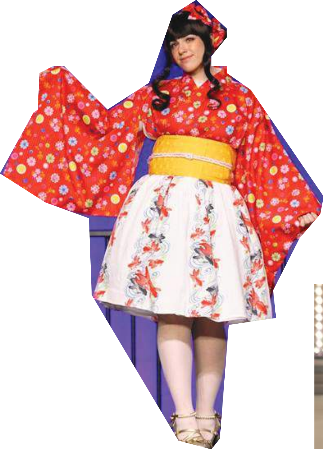
Ready to Wear by SA Design by Sasa Summer 2018