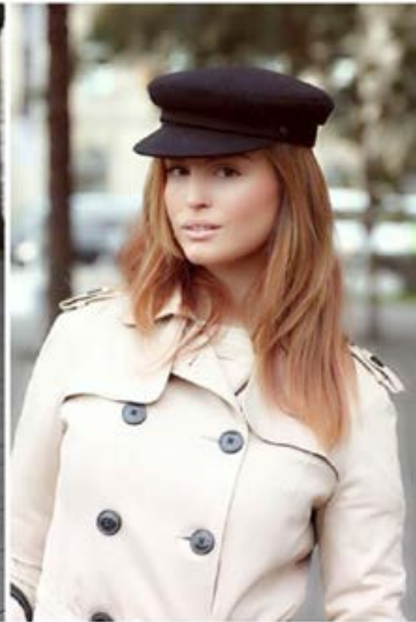
Street style Divinity Magazine