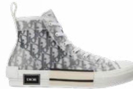
Christian Dior B23 High-Top Sneaker 1450.00$