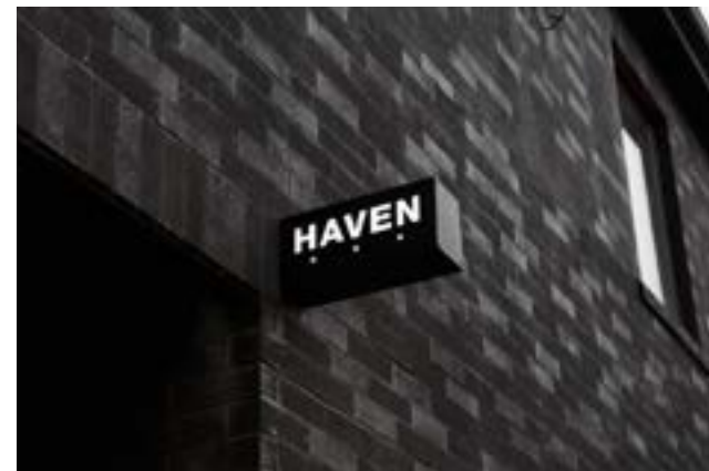
Haven A Canadian Store Founded In Edmonton, Alberta