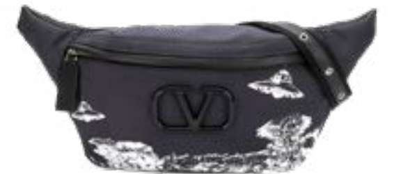
Valentino Garavani X Undercover Time Traveller Belt Bag 1480.00$