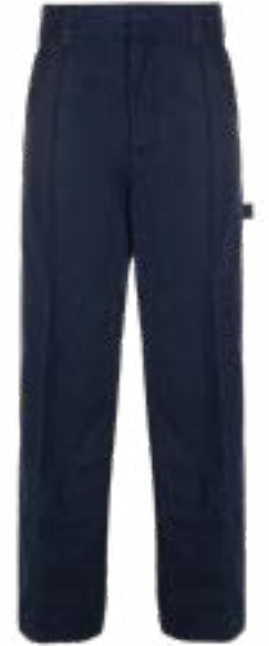
Acne Studios Unisex Workwear Trousers 410.00$