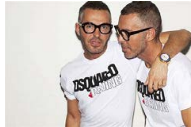
Dean and Dan Caten Founders of Dsquared2