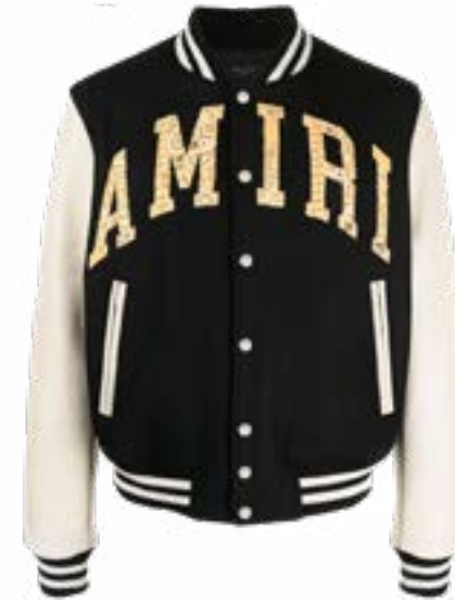
Amiri Logo-Patch Bomber Jacket 4,435.00$