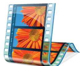
Windows Movie Maker