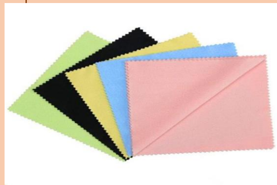
MICROFIBER CLEANING LENS