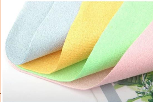
MICROFIBER AUTOMOTIVE WIPE