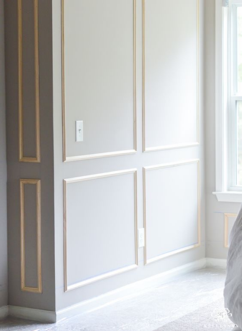
Wooden wall panels