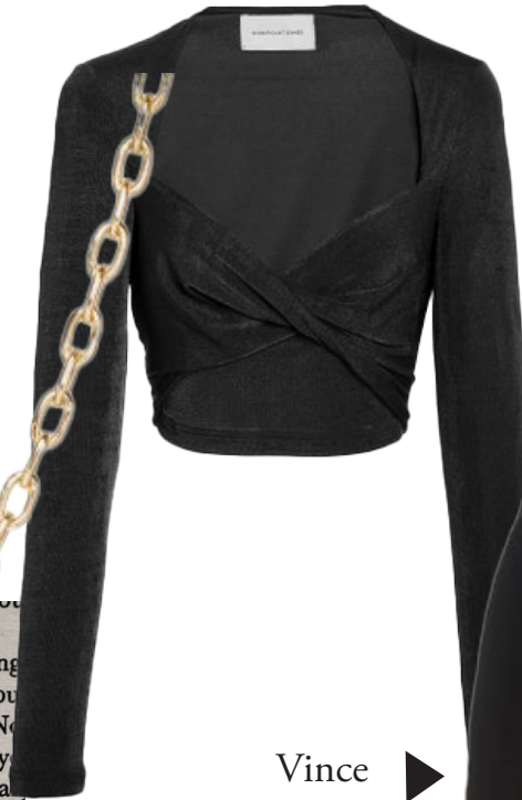
Significant Other $160.00