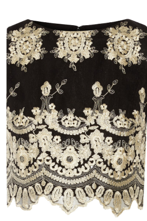
ALICE + OLIVIA

Be daring and try a full suede look. With a tall suede boot, a short suede dress and a neutral turtleneck, you will stand out and look polished.