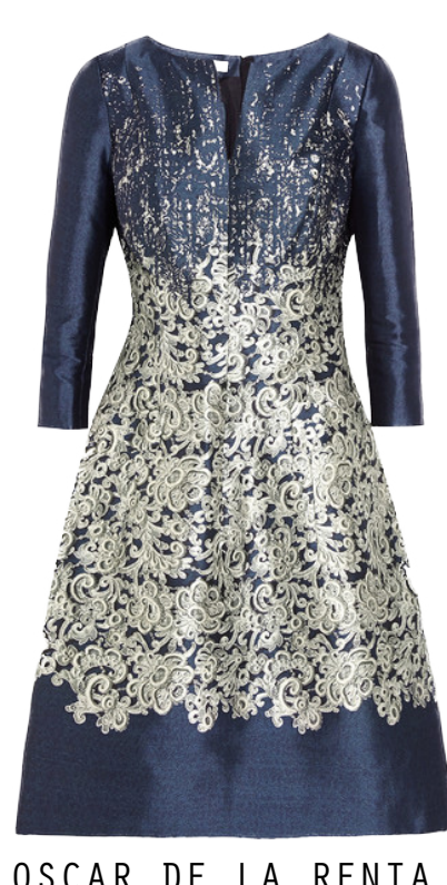
OSCAR DE LA RENTA