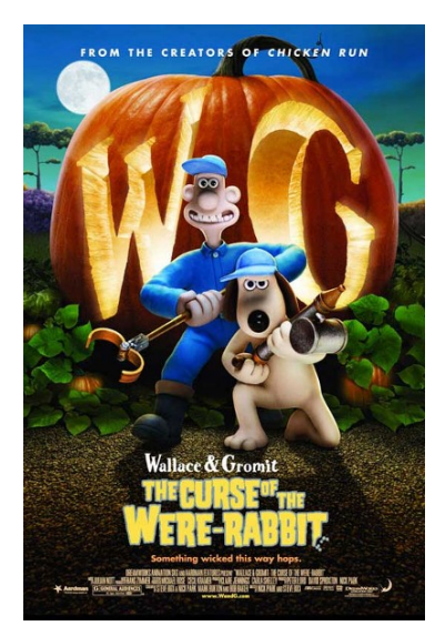
PARK, Nick December 6, 1958 – Present Wallace & Gromit: The Curse of the Were-Rabbit (2005) Aardman Animations – DreamWorks Studios [https://www.youtube.com/watch?v=566_PBg6jkE]