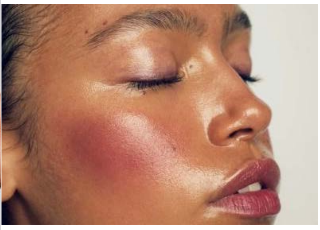
A woman is all Spring no fall no winter no summer she blossoms all year round SARUSINGHAL