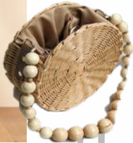
mini hand bags