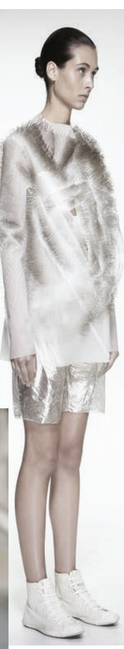
Ying Gao Conceptual Clothing 2013 MONTREAL