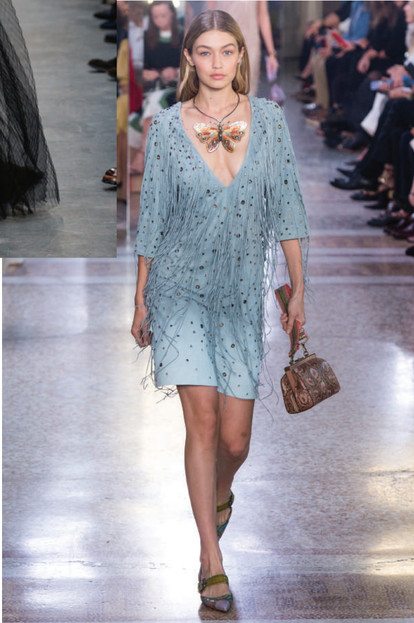
Bottega Veneta Spring 2018 RTW Milan