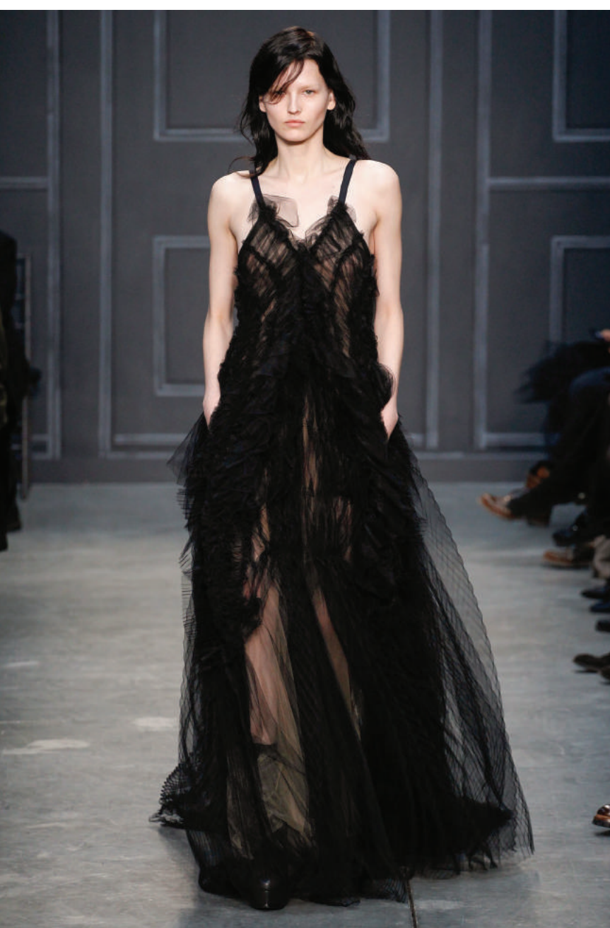
Vera Wang Fall 2014 RTW NY