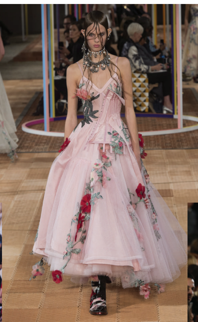
Alexander McQueen Spring 2018 RTW Paris