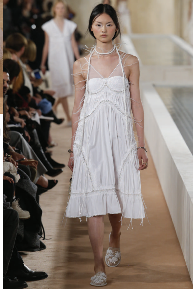
Balenciaga Spring 2016 RTW Paris