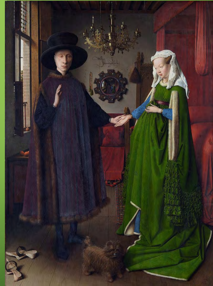
Taggart, Emma. "The Arnolfini Portrait' (1434) by Jan Van Eyck." The History of the Color Green: From a Poisonous Pigment to a Symbol of Environmentalism , My Modern Met, 16 June 2020, mymodernmet.com/history-of-the-color-green/ .