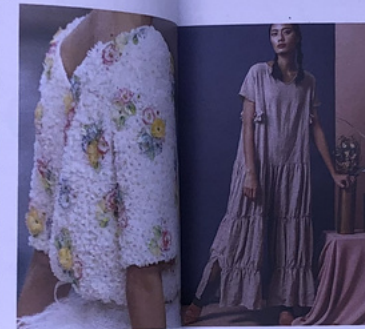
Hearts and Found

Each design from Hearts and Found can be made to your specific measurements in the fabric of your choice.