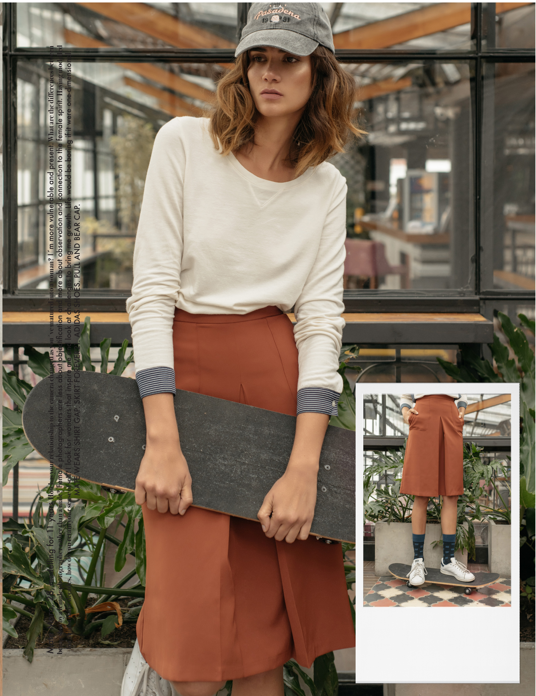
MATE WEARS SHIRT GAP, SKIRT FOREVER 21, ADIDAS SHOES, PULL AND BEAR CAP. "How has your relationship to the camera changed as you've matured into a woman? I'm more vulnerable and present. What are the differences between male and female photographers? I look for wonders that inspire me and look at challenges to bring me growth. Life would be boring if it were one-dimensional."