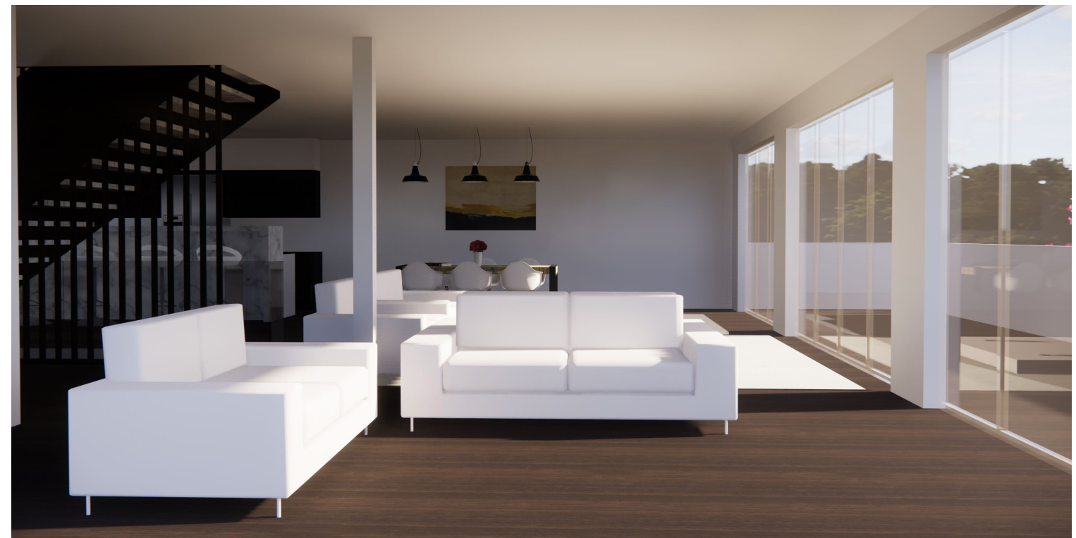
LIVING ROOM VIEW