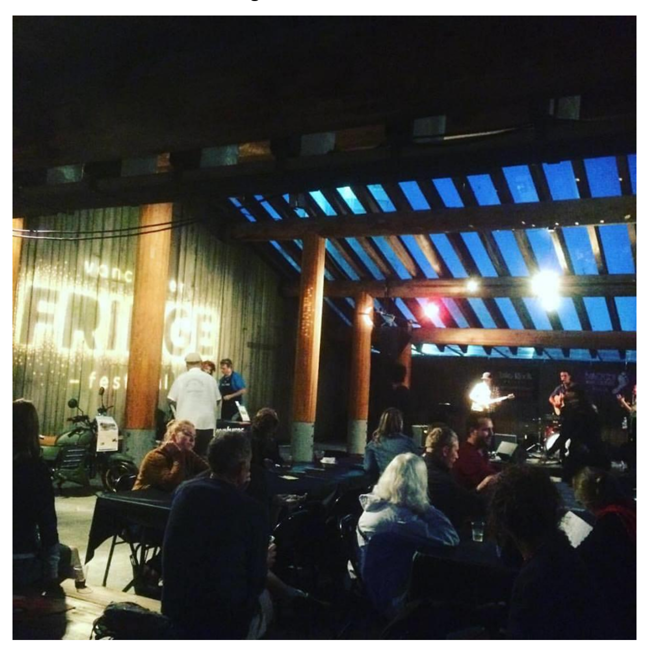
Fringe Festival Volunteer