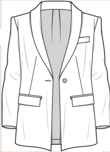
Green blazer 0001