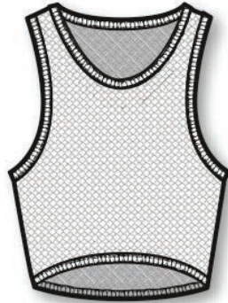
Rib-knit tank top 0002