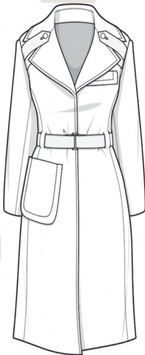
White trench coat with buckle belt 0004