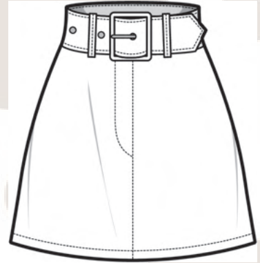
Green mini skirt with belt 0003