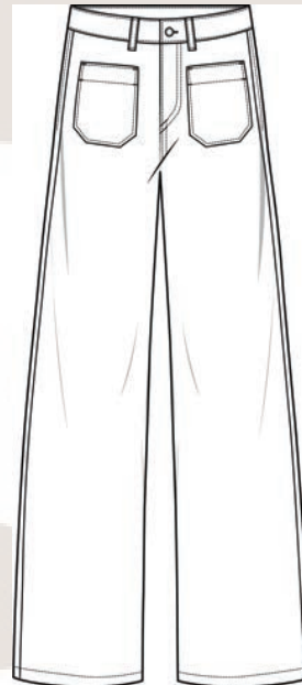
Cow print jeans 0005