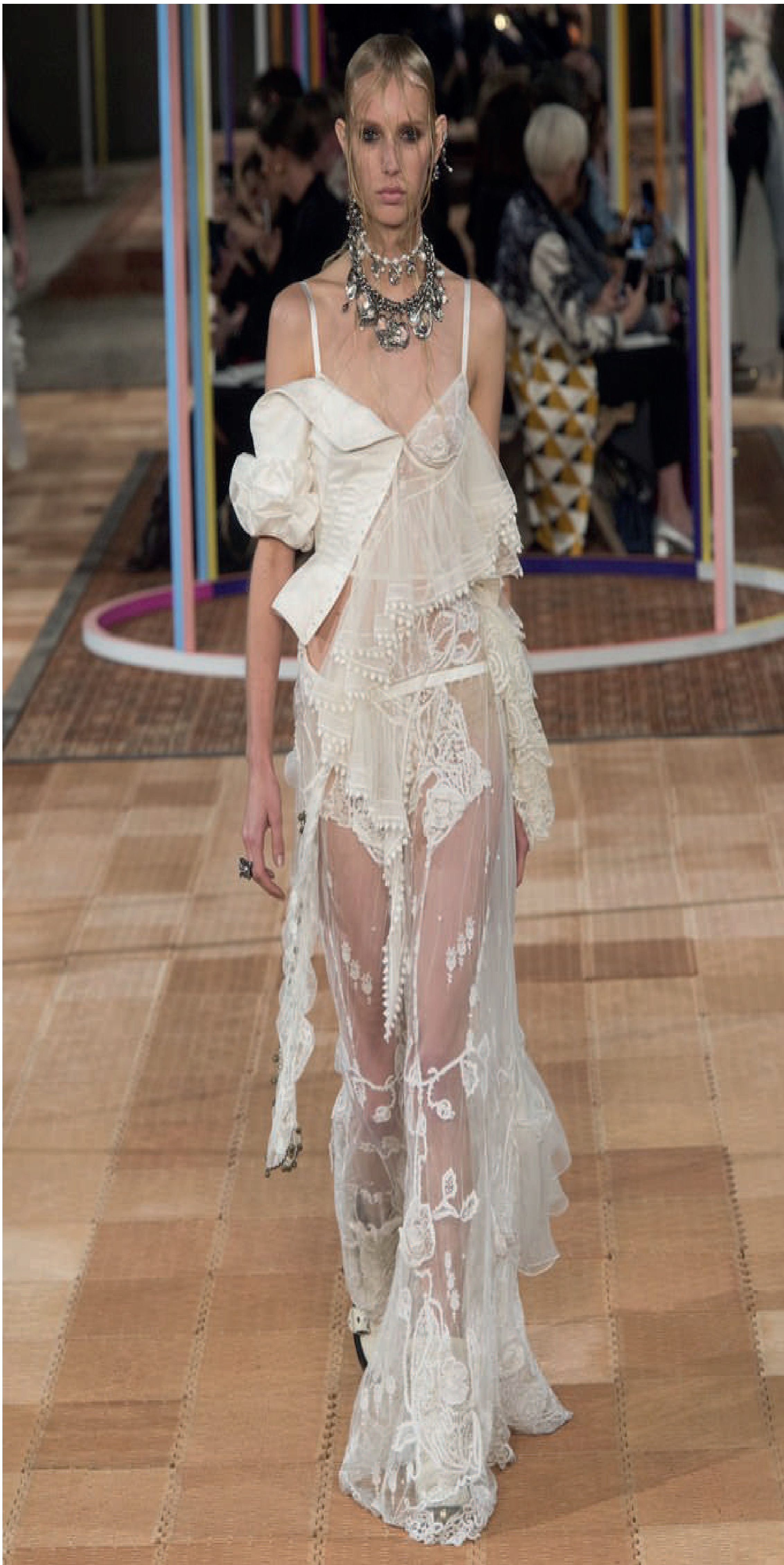
Alexander McQueen SPRING 2018 READY-TO-WEAR Fashion Show