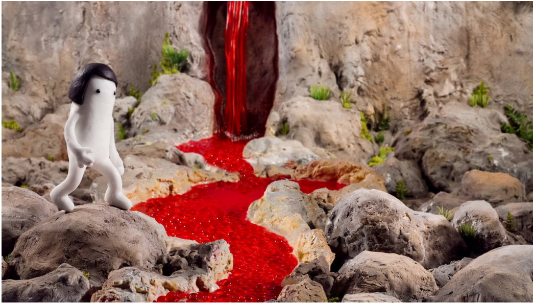
Kirsten LEPORE Move Mountain 2013 Stop Motion film [http://kirstenlepore.com/Move-Mountain]