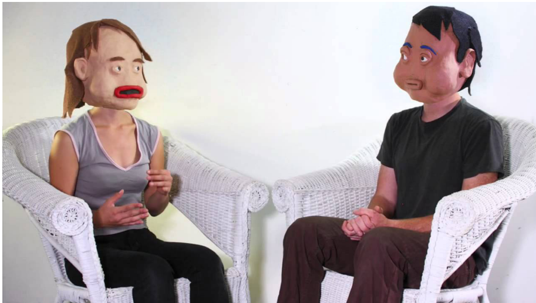
Kirsten LEPORE Artsy Fartsy 2009 Stop motion [http://kirstenlepore.com/Artsy-Fartsy]