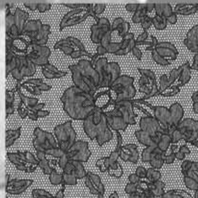
91% Nylon, 9% Spandex