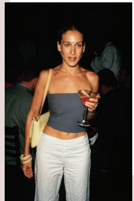
Sarah Jessica Parker in 1998

Sarah’s character Carrie would be seen wearing everything designer which followed her even off the set. She would wear well known fashion brands and very stylish clothing. While walking red carpets Sarah would usually be seen wearing Versace. From fur coats and sling backs, we could also see her wearing slip dresses , blazers and even bras. Sarah Jessica Parker remains an icon to this day, so does her character Carrie.