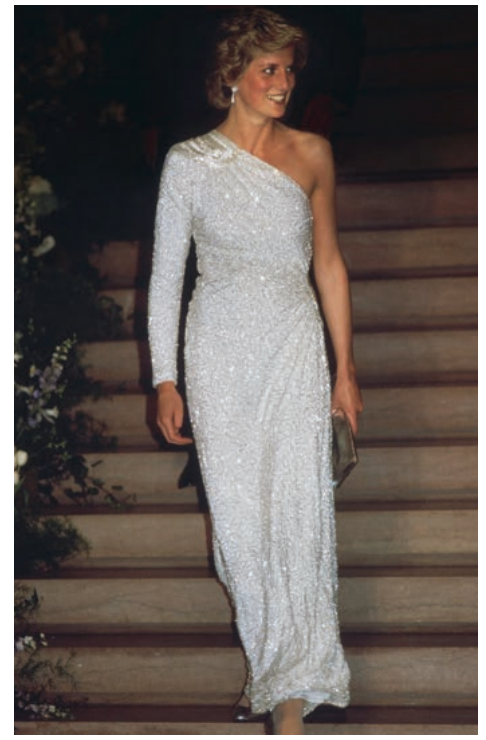
Princess Diana in Hachi, 1989

Princess Diana was not only a princess but also an icon. The princess has been influencing fashion for as long as she lived. She tragically passed away at only 36 years in a car crash, back in 1997. We could often see Princess Diana wearing very fashionable clothing and accessories. She would always be matching her accessories to her outfits, even her bold jewelry . We could also see her wearing colorful down to earth clothing, because even a princess does regular things. Princess Diana often wore shoulder pads, pant suits, dresses, and gowns. Diana continues to be a symbol of love and a fashion icon to this day.