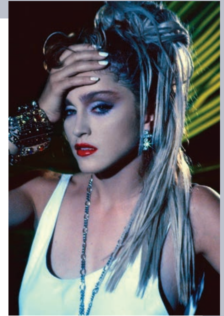
Madonna

With her first number one hit Like A Virgin , Madonna not only dominated the music industry but also the fashion industry. Often wearing colorful clothing and rubber bracelets, her red carpet looks stunned the world. In the early 80's Jean Paul Gauthier , fashion designer, dressed Madonna in a bustier, which has been auctioned for 72,000$ .