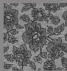
91% Nylon, 9% Spandex