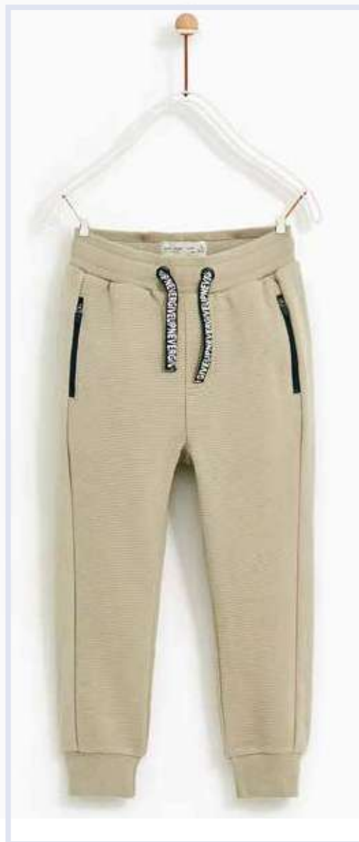
ZARA BOY JOGGERS