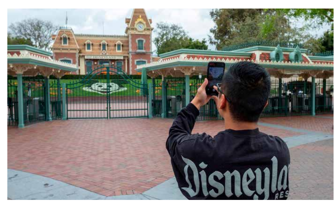
Disneyland, in Anaheim, Calif., has been closed since March.