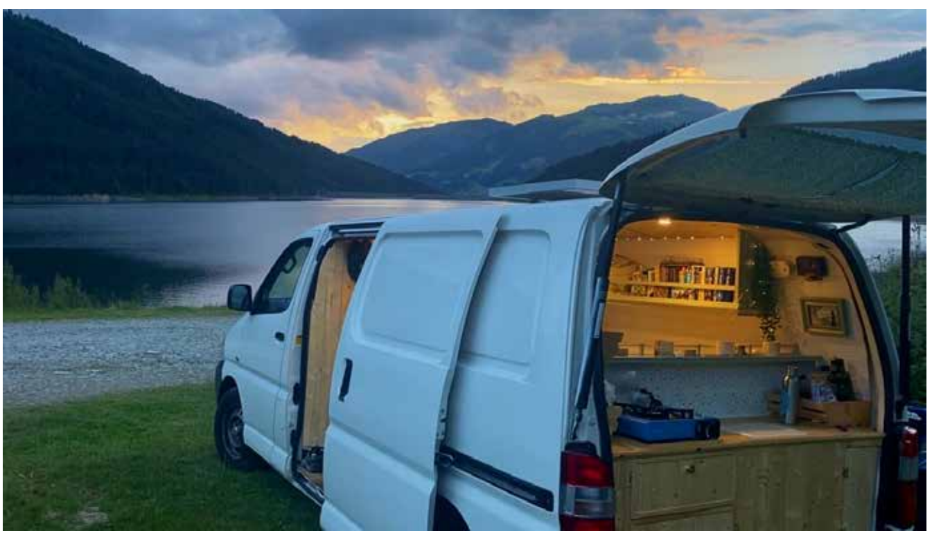
Travelling in a converted van and stopping to enjoy alpine views in Austria

ou must stay at home" Boris utters five crushing words, and that's it; eight flights cancelled, hotel bookings doomed and the supermarkets run out of toilet rolls. A new normal we are told, well, it doesn't feel very normal to me.