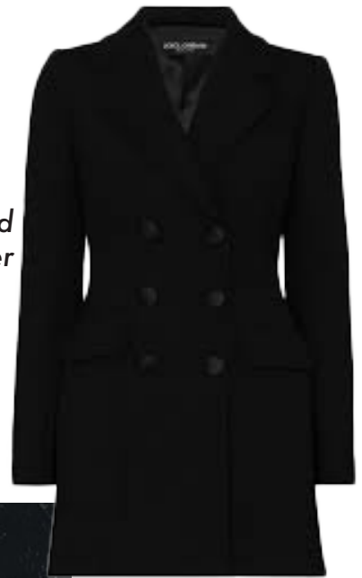
Fitted double-breasted blazer