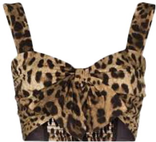
Leopard print croptop