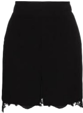
Lace trim skirt