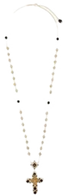
Stone embellished cross necklace