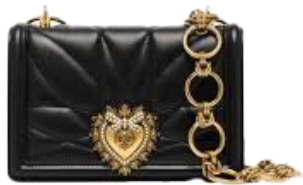
Mini Devotion cross body bag