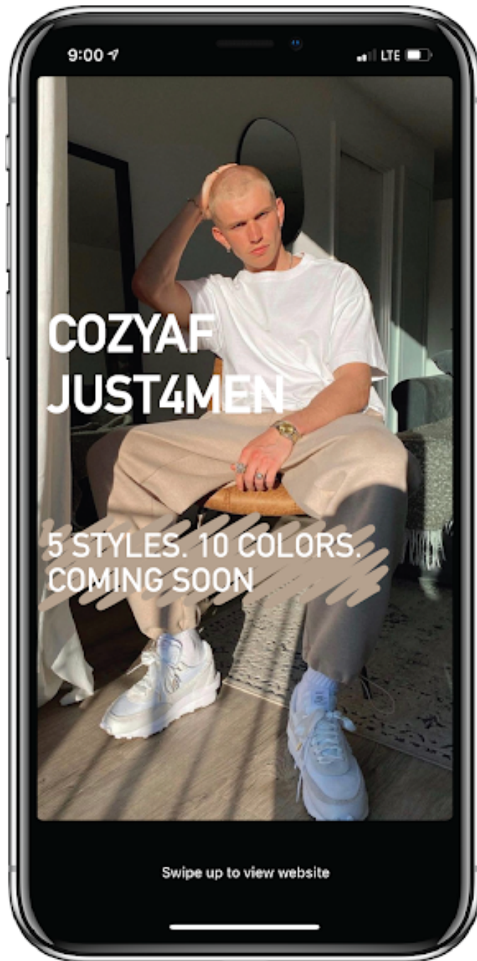
Story 1 on October 13 2021