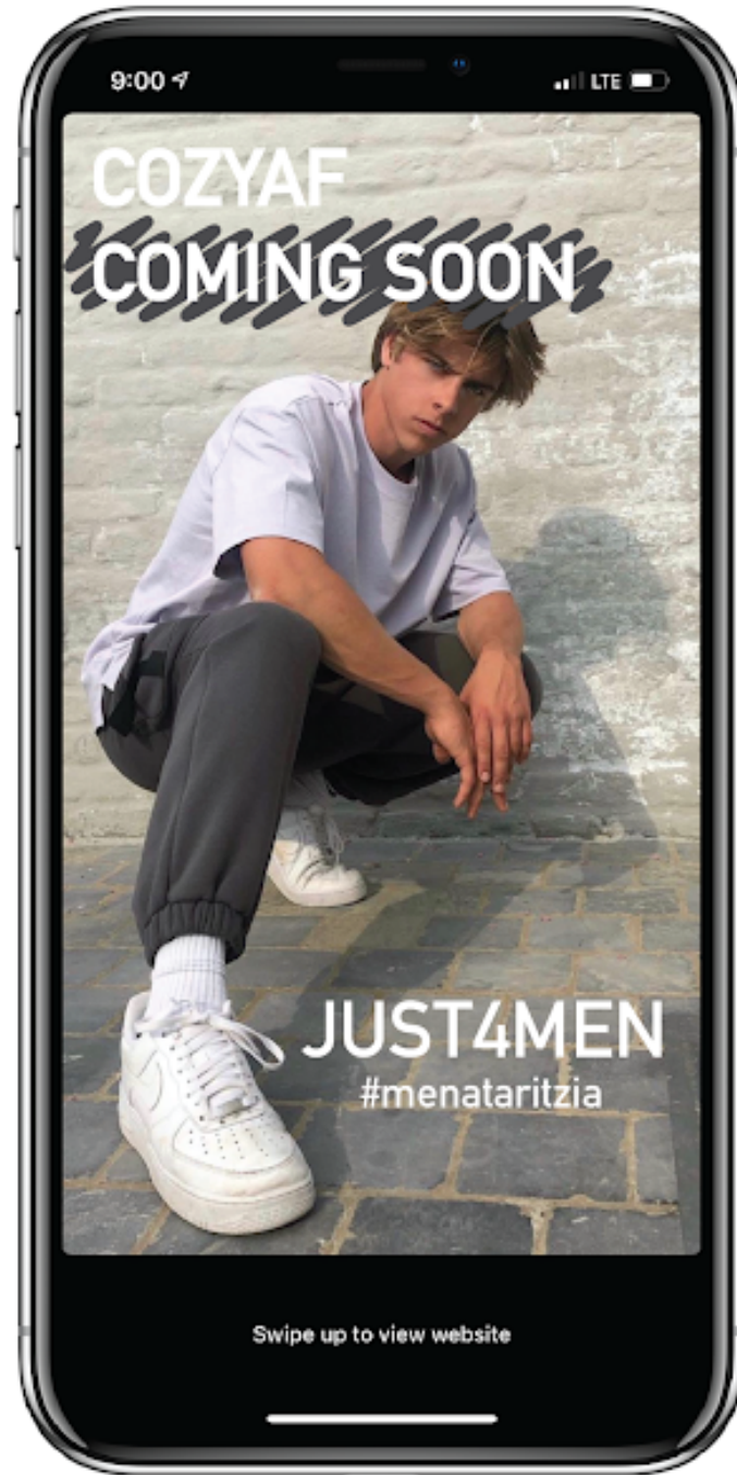
Story 2 on October 21 2021