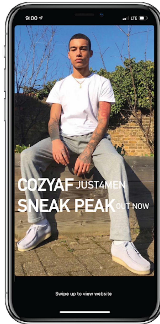
Story 3 on October 29 2021