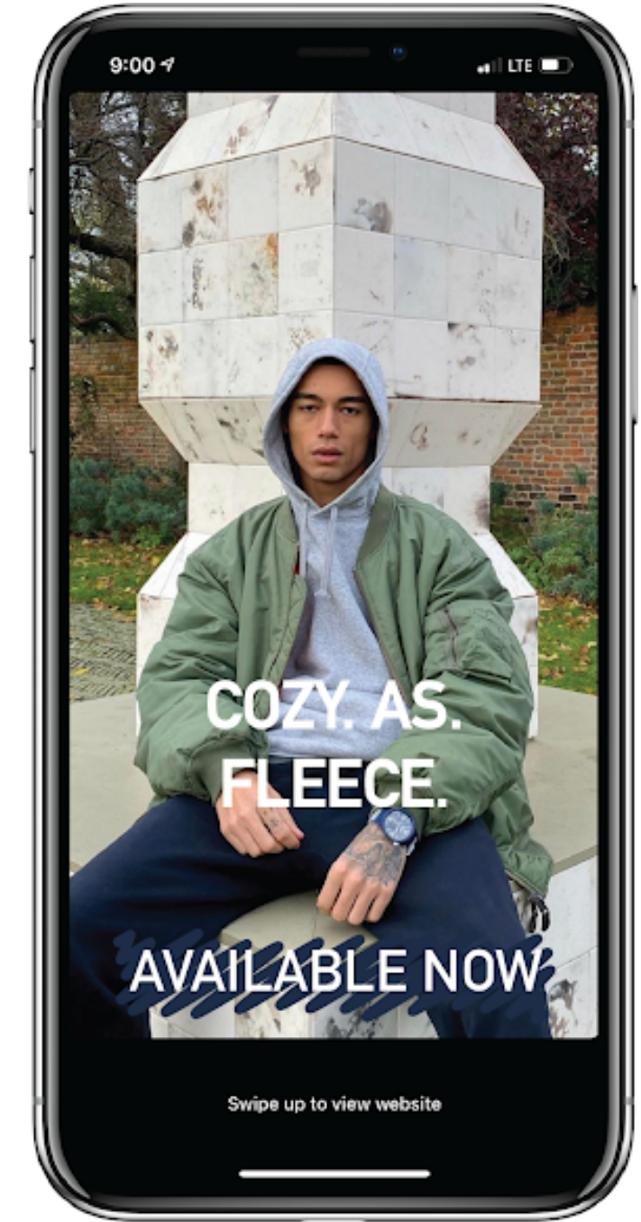
Story 5 on November 5 2021