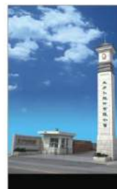
4 The front gate

To provide a convenient working environment, employee canteens, fitness center, and dorm are facilitated in Taichung office.