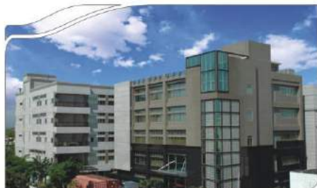
1 The Headquarters Building